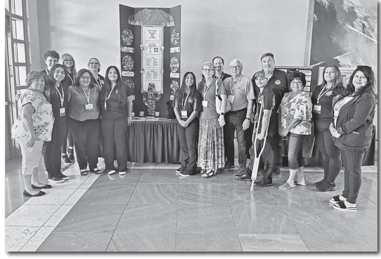
The Superior Town Council and the Town of Superior Youth Council attended the 2022 League of Cities and Towns Conference. They are pictured here in front of the project board prepared and submitted by the youth council.

The Superior Youth Council participated in the full day leadership conference where they learned new leadership