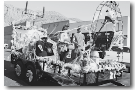
Senior Float – Second Place