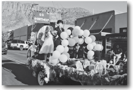
Freshmen Float – Third Place