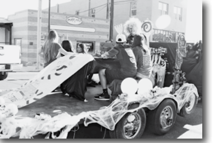
Sophomore Float – Fourth Place