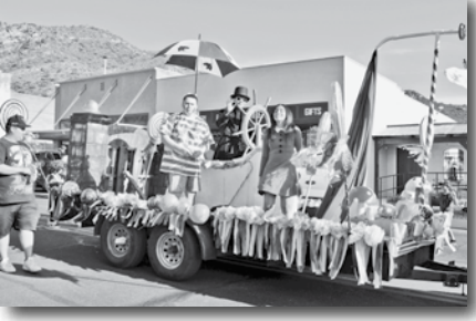
Junior Float – First Place