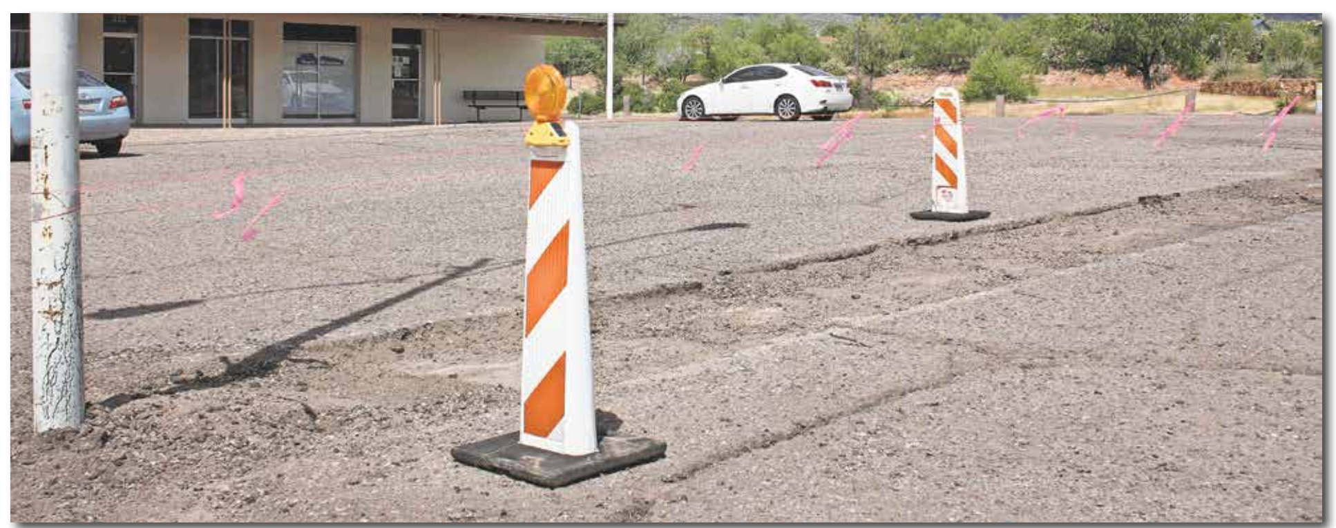
In case you're wondering what's going on with the parking lot between the ARC and Teapot Family Dentistry in Kearny, the new owners will be paving the lot soon.