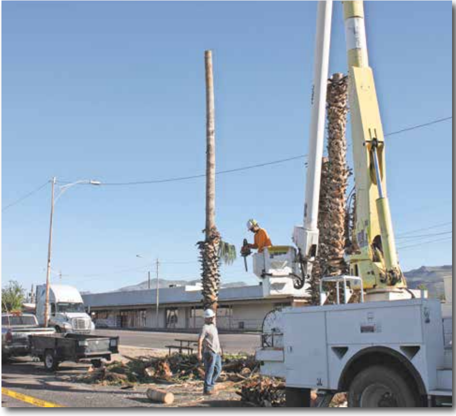
A palm tree located on Alden Rd. in Kearny was sawed down last week. A local company, 2K, LLC did the work. There were five palm trees sawed down on Alden Rd. in Kearny ranging in height from about 60 to 20 ft. tall. The palm trees were brought down to make room for new shade trees to be planted later according to the new owner James Ruiz of the shopping center.