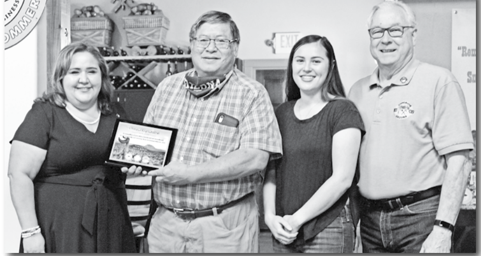
Save Money Market