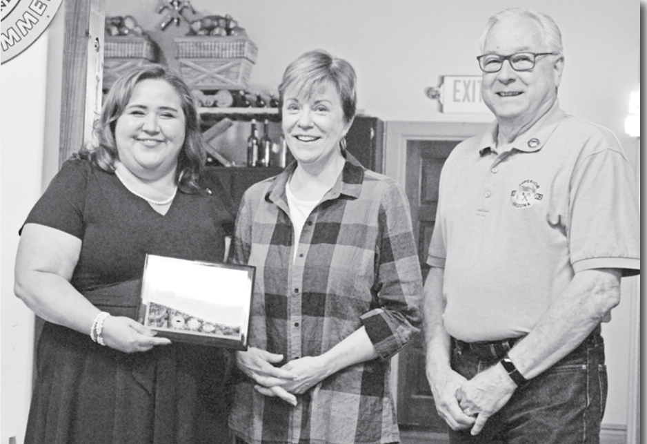
Boyce Thompson Arboretum