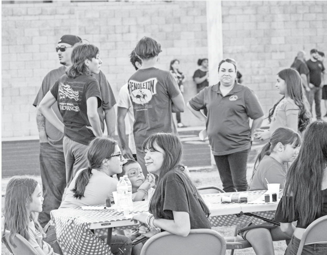
Face painting at the Mammoth-San Manuel Meet the Teacher night.