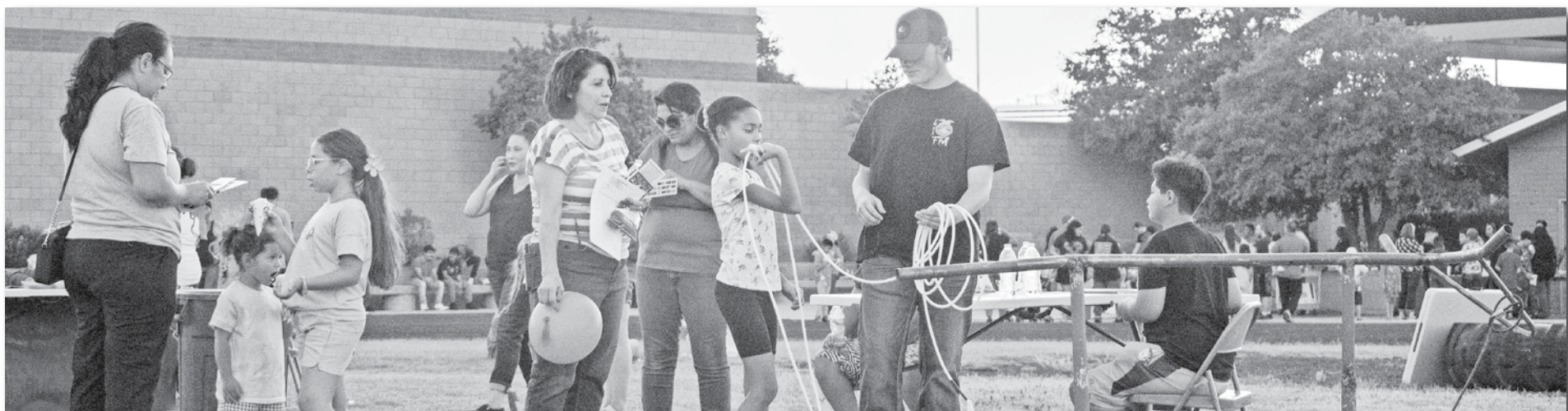
Learning how to rope at the Meet the Teacher Night at the San Manuel Football Field.