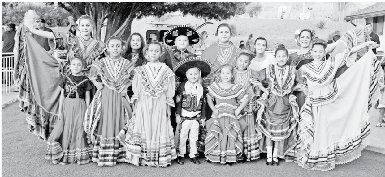
The Superior Dance Company provided entertainment at the Rural Policy Forum.