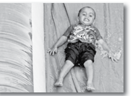
Free Water Splash Fun Event!

On Friday, Aug. 6, 5-9 p.m. at the Hayden High School football field in Winkelman, there will be waterslides at the Free Water Splash Fun Event. Bring your swimsuits and towels! Bring your own lawn chairs! There will be free hot dogs, water, popsicles and watermelon, too! All are welcome! This event is hosted by HWUSD, Town of Hayden and Town of Winkelman.