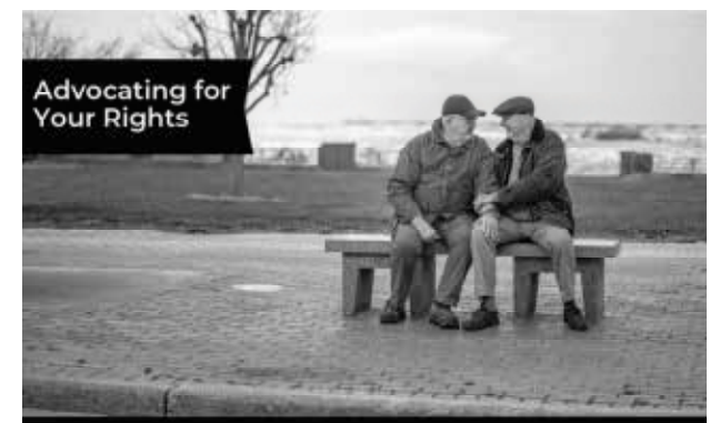
The Long-Term Care Ombudsman Program is available to residents of nursing homes, assisted living facilities, and adult foster care homes.

The park is located on Hwy. 177 near Kearny. For more information, call them at 520-363-5446.