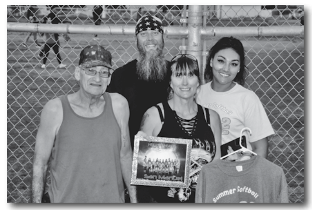
The team of Hell's Angels presented gifts of appreciation to San Manuel Revitalization Coalition members at the Summer Softball League 2022 Closing Ceremonies.