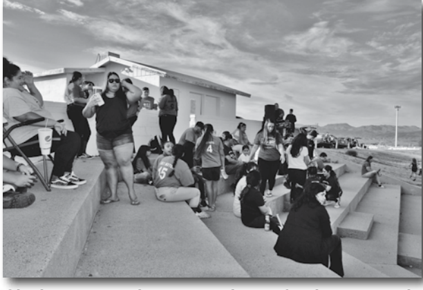
Closing ceremonies were a chance for the community to show their appreciation to the players, parents, sponsors, and volunteers.