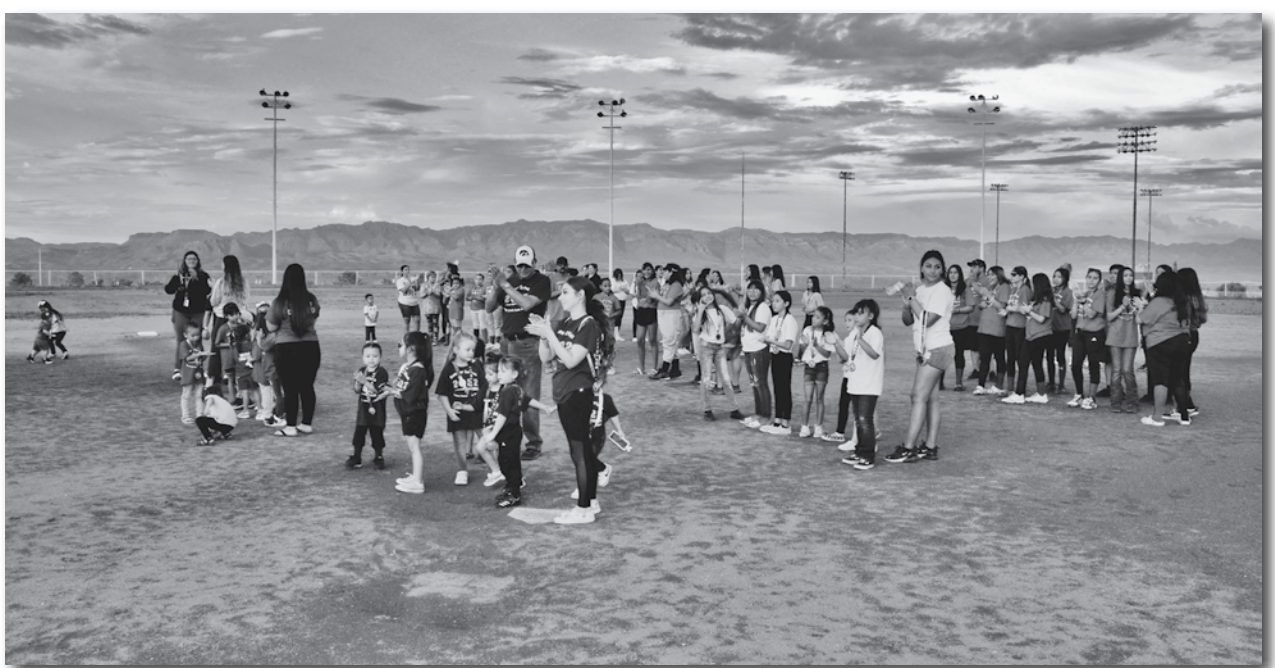
A total of 13 teams from San Manuel, Mammoth, Oracle and Hayden brought summer softball under the lights back to the Tri-Community.

Sponsors of this season included: Downtown Hardware, Salt N Pepper, SaddleBrooke Community Outreach, Cheetovibez, San Pedro Pizza Company, 7 Sky Motel, SaddlerBrooke Rotary Club, San Manuel Revitalization Coalition, Oracle Ford, Silver Mountain Mining and BAM. Thanks to all who helped make the 2022 season a success. The community is already looking forward to the 2023 season.