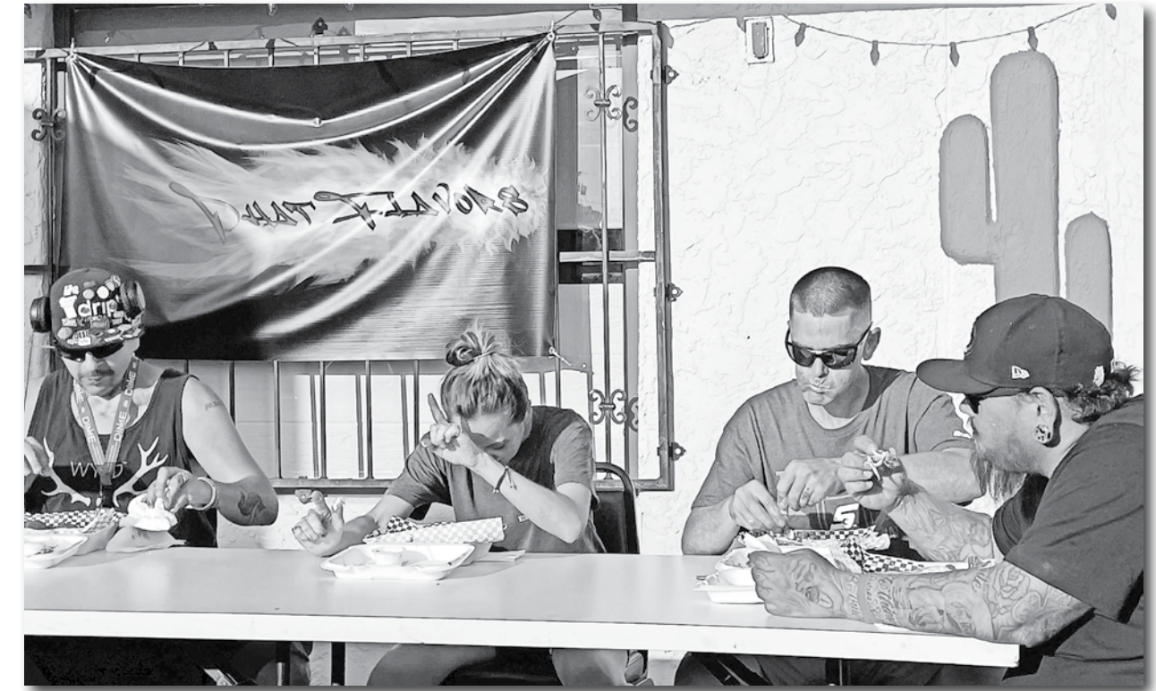
Braving the new hot wings at Phat Flavors.

Only five people were brave enough to test their might against the brand new Phat Flavors hot wing competition. The goal was to devour 12 dangerously hot wings in under ten minutes. Eyes watered, while fingers and faces got covered in sauce, some competitors even had