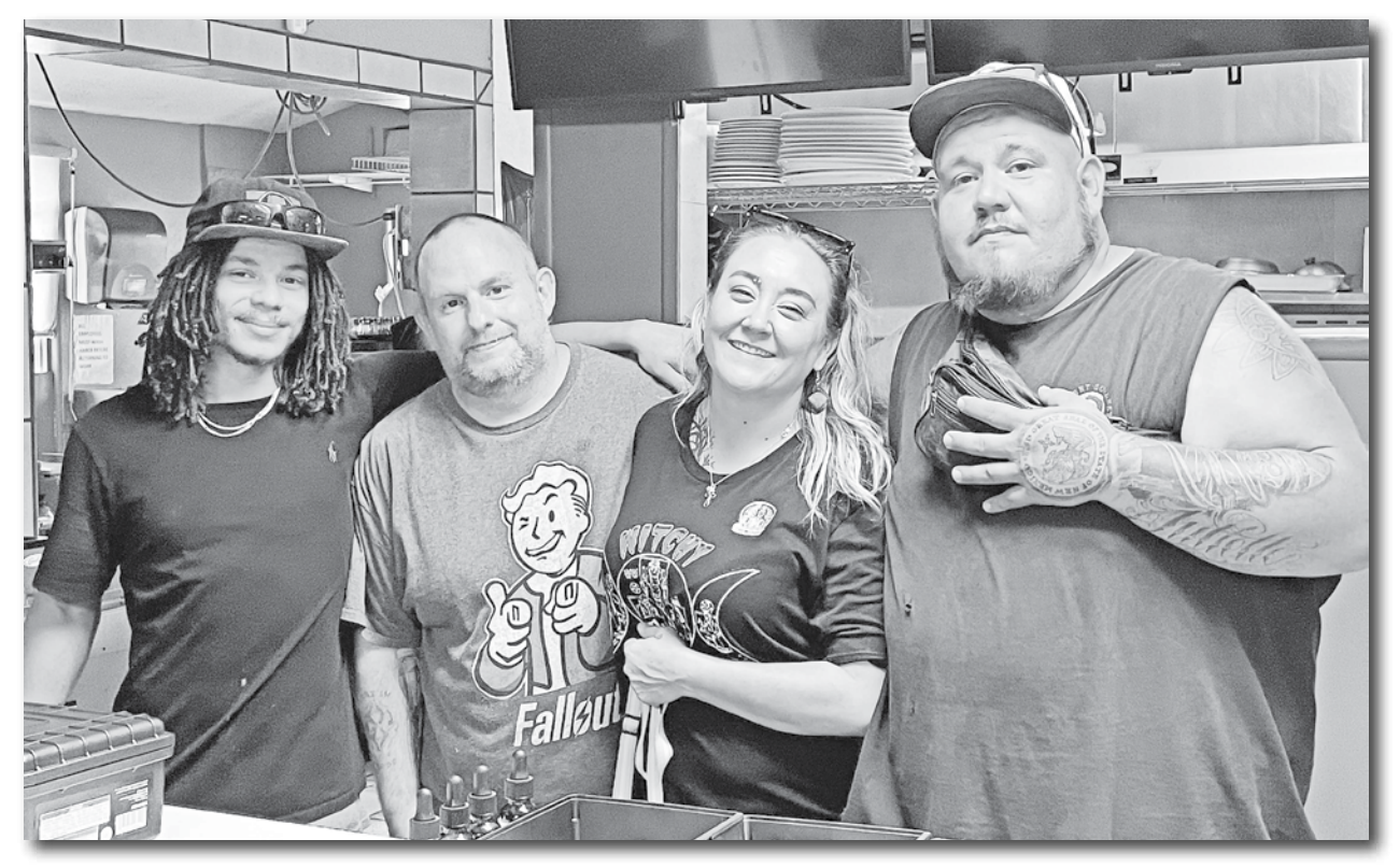
The Phat Flavors crew.

Phat Flavors and FamBam Genetics are scheduled to host the "Spooky Social" in late October, with live music, more vendors, a pie-eating contest and a costume contest.