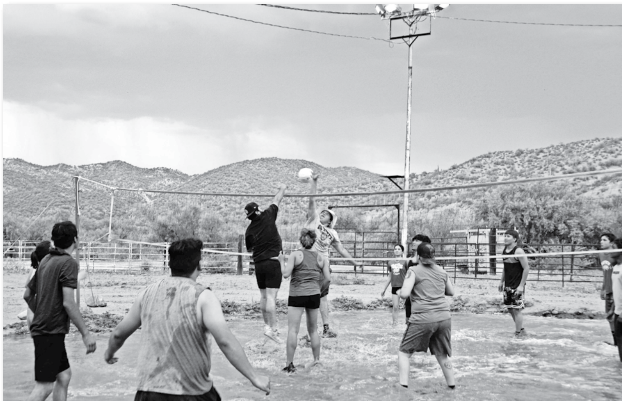
Mud Volleyball action.

Winkelman Flats got a lot muddy on Saturday when several teams turned out to play in the Hayden High School Coed Mud Volleyball Tournament fundraiser. Teams played in ankle-deep water and mud. And, though wet, a good time was had by all who played. The funds were donated to the Hayden High School football team.