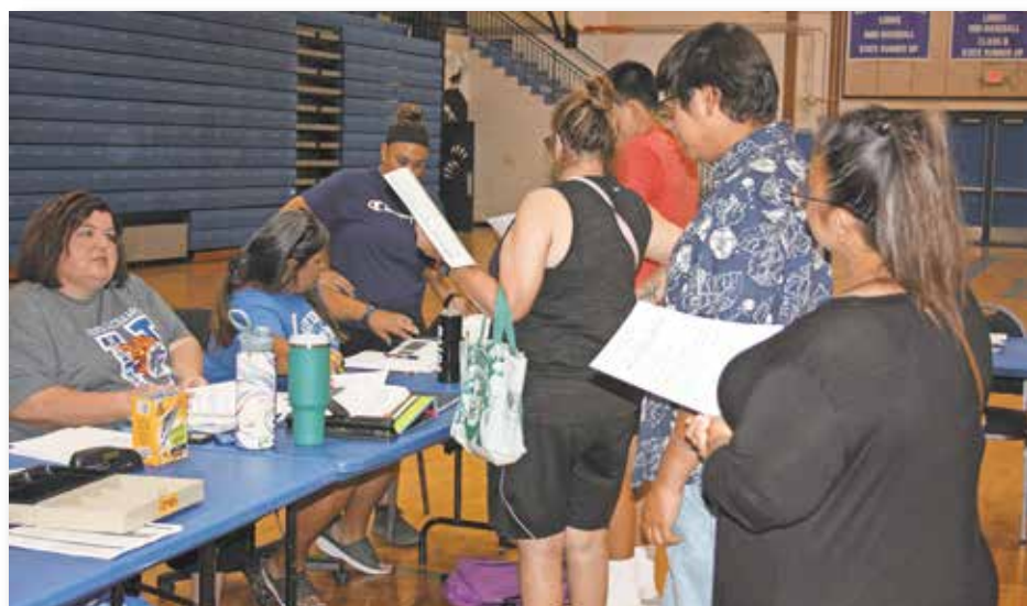
Ray students registered for the new school year on Thursday.