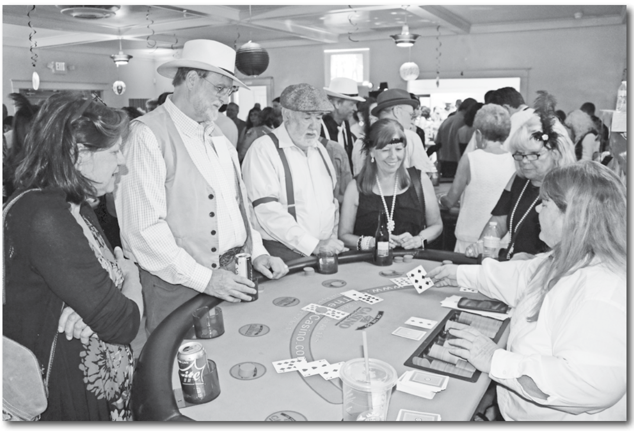
The ever-popular Magma Royale, the Superior Optimist's premier fundraiser, will return to Superior in January.