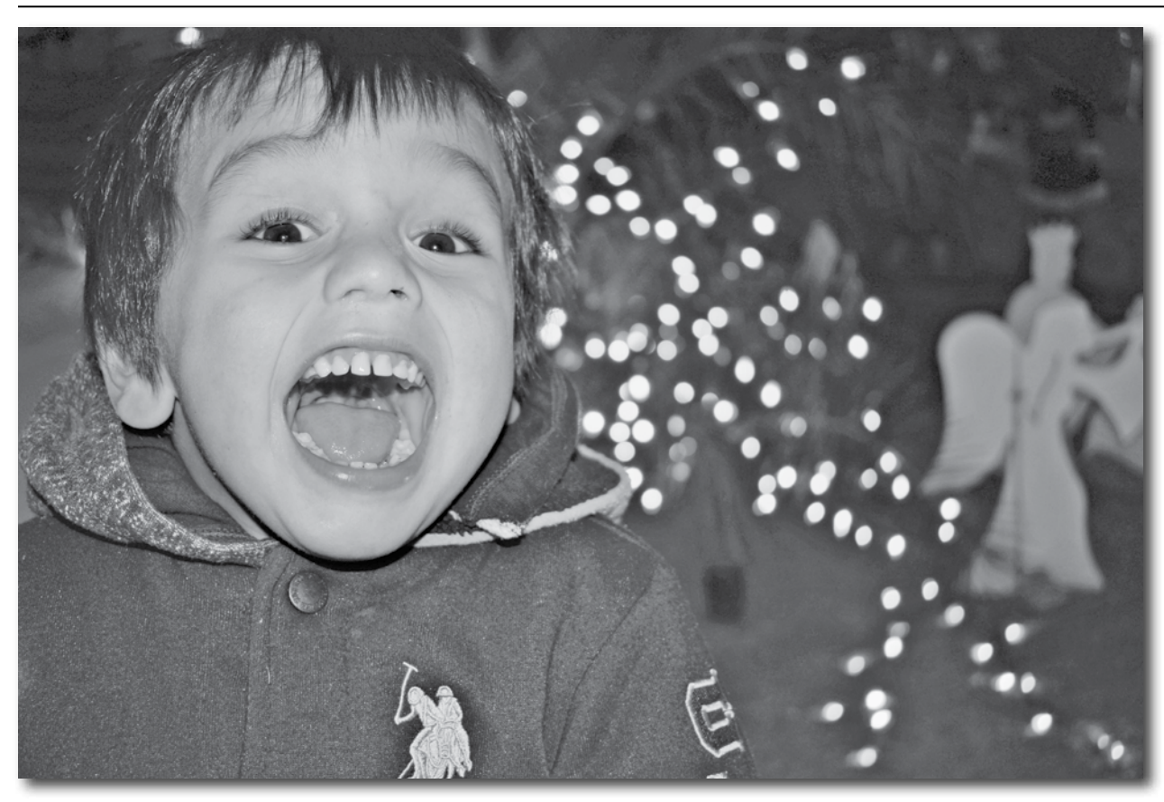
Is this maybe a sign that things are starting to return to normal? The Superior Optimist Club announced that the Miracle on Main Street will return this Christmas. Start dusting off those floats and make sure your lights are all working! We expect great things from Superior this year!