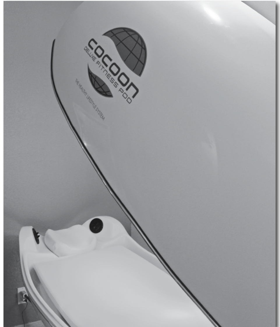
The Cocoon Wellness Pod at Jules Salon and Wellness Center in Oracle.