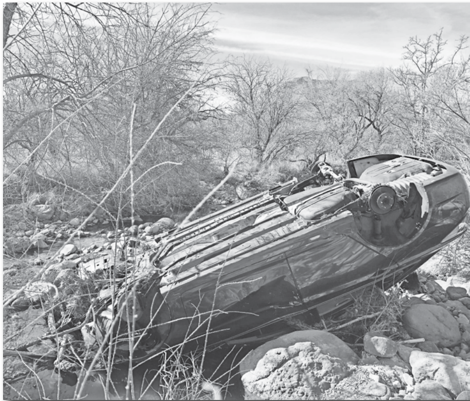
At least one vehicle has been washed downstream during a flash flood at the Queen Creek Panther Drive crossing.