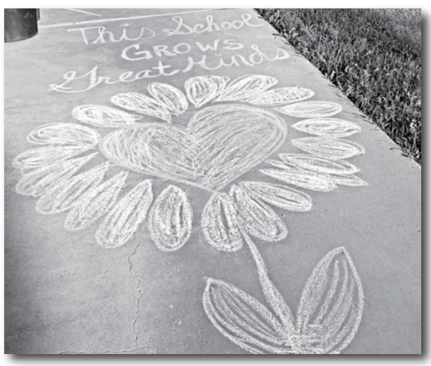
Lots of chalk drawings greeted Ray Elementary and high school students on their first day back to school.