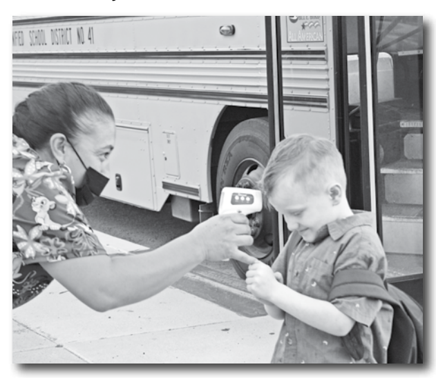
The Hayden students had their temperatures check before entering the campus.