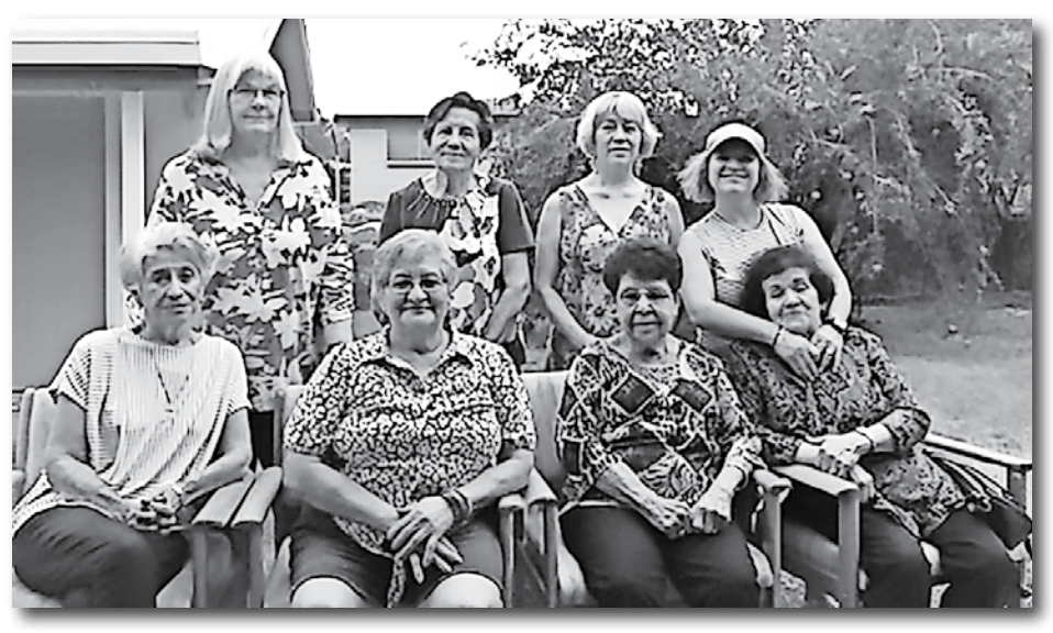
Members of the Kearny Women's Club.

The lockdown continued for nearly two months. When Gov. Ducey finally gave the go ahead to reopen, businesses slowly