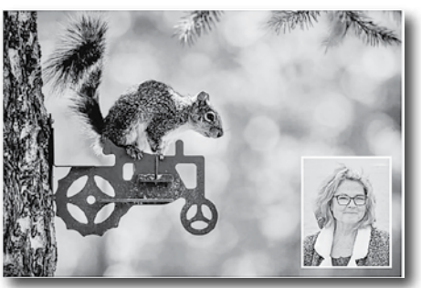
Rim Country Camera Club

All entries will be judged by a panel appointed by the Rim Country Camera Club. Only owners of selected photos will be notified. Photos that do not meet the quality requirement will not be judged. Copyright holders retain copyright of their work. Holders of selected photos grant the