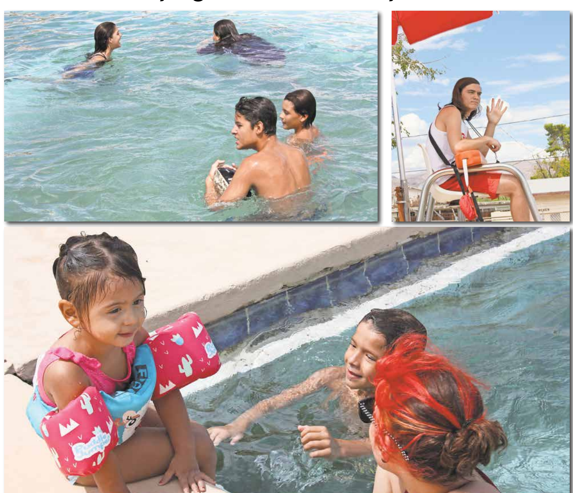
Thanks to a little help from Pinal County and Resolution Copper, the Kearny Pool is open and ready to keep Copper Basin area folks cool in the pool. These kids took advantage of the brilliant blue oasis to cool off during the hottest part of the day all under the watchful eyes of the lifeguard.