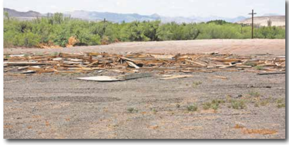
A leveled area ready for expansion. Still some used lumber available for the fire victims.