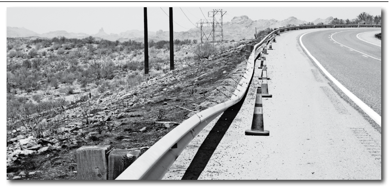
Drivers should be extra careful when Arizona Department of Transportation workers are replacing burned and damaged guardrails.