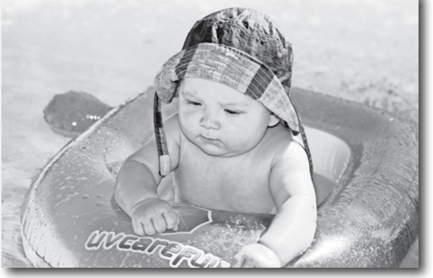
Swimming pool fun.