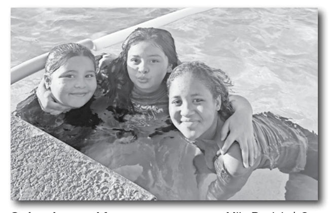
Swimming pool fun.