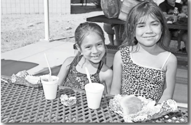
Having a meal at the pool.