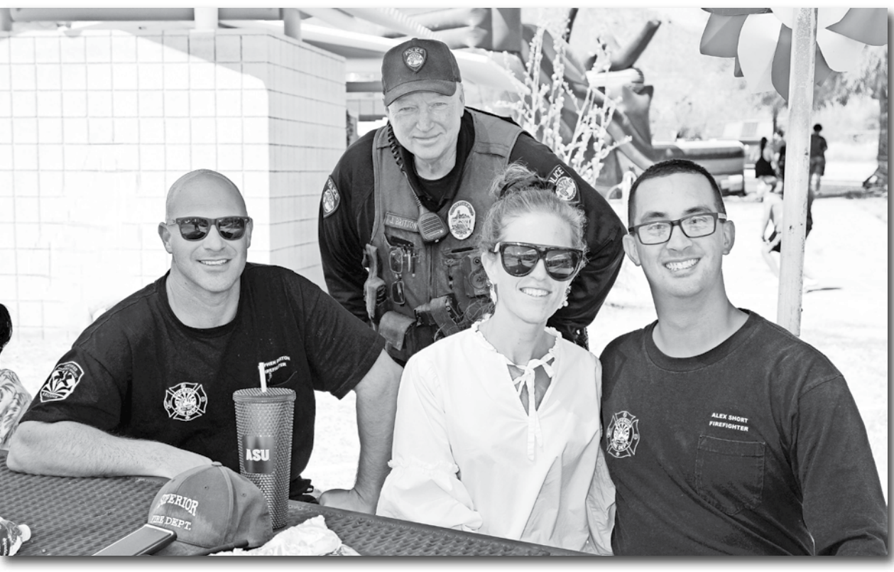
Members of the Superior Fire Department and Police Department at the July 4th event.