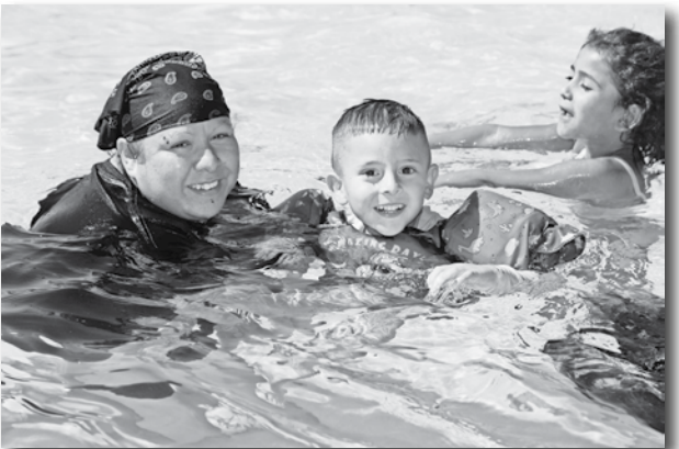
Swimming pool fun.

Supporting the event were Red Bear Outfitters, OMYA, VFW Truman Post and the Town of Superior Youth