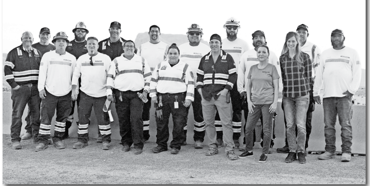
Resolution Copper Team.