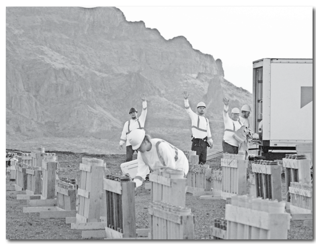
Southwest Fireworks Team take time to wave at the camera.