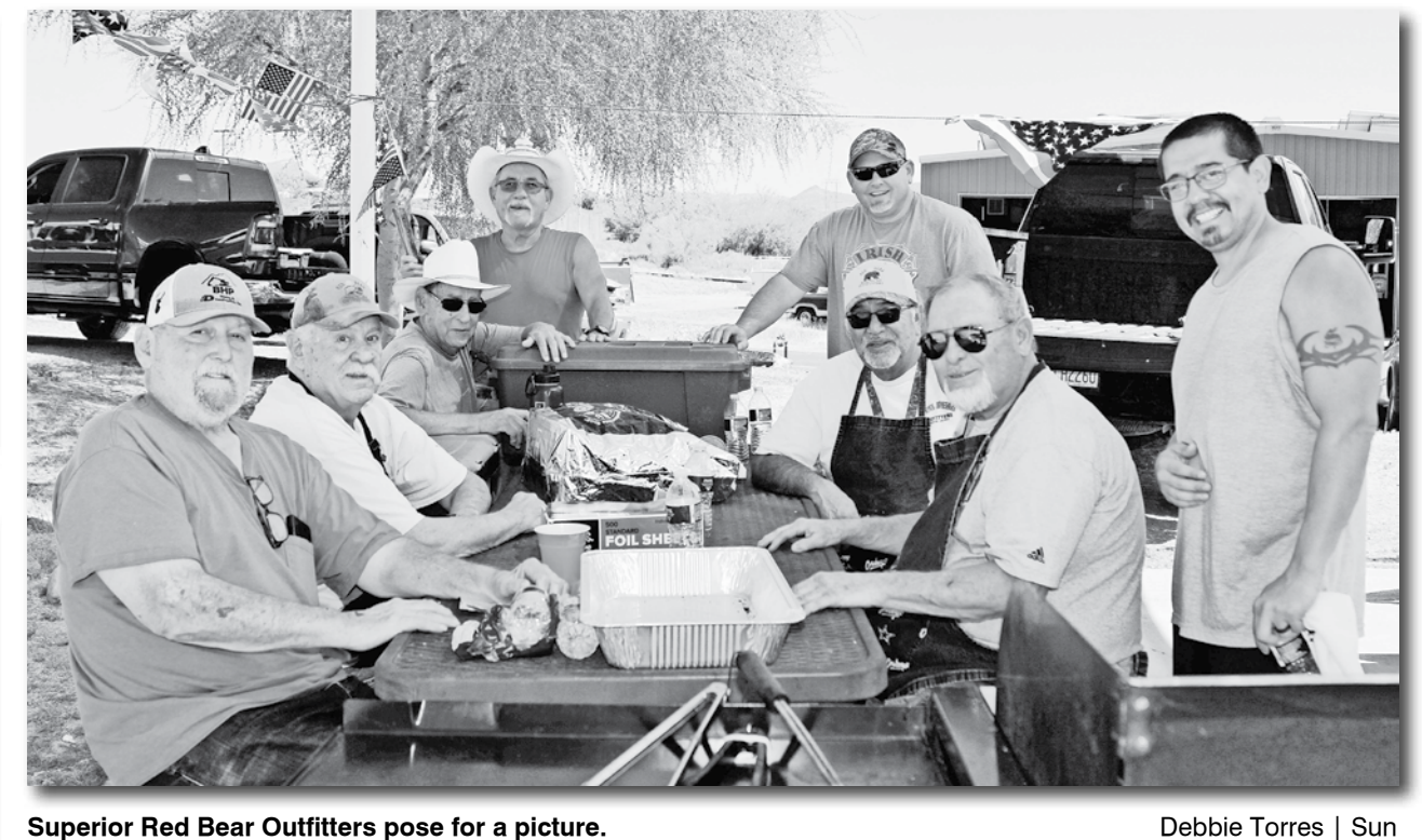
Superior Red Bear Outfitters pose for a picture.