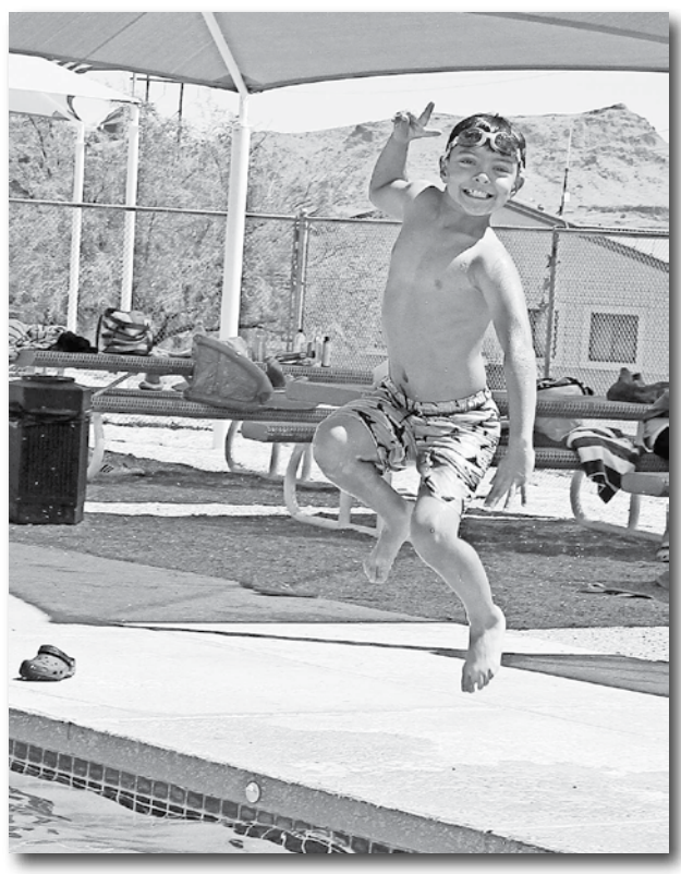
Swimming pool fun.