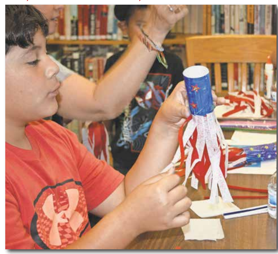
Kids at the Hayden Library made Independence Day paper items for their papercraft day on Monday.