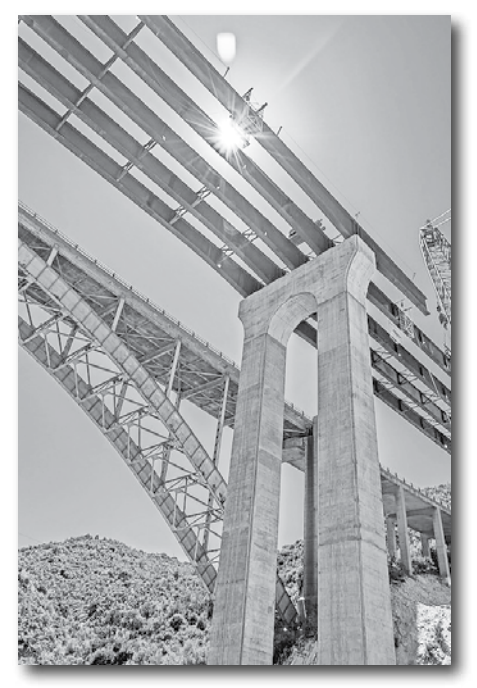
Pinto Creek Bridge, the old and the new, side by side.

Motorists with a destination between SR 177 and Top-of-the-World to the west of Pinto Creek, or between Miami and Pinto Valley Mine Road east of Pinto Creek, will be allowed to pass during the closure. No vehicles will be allowed between Top-of-