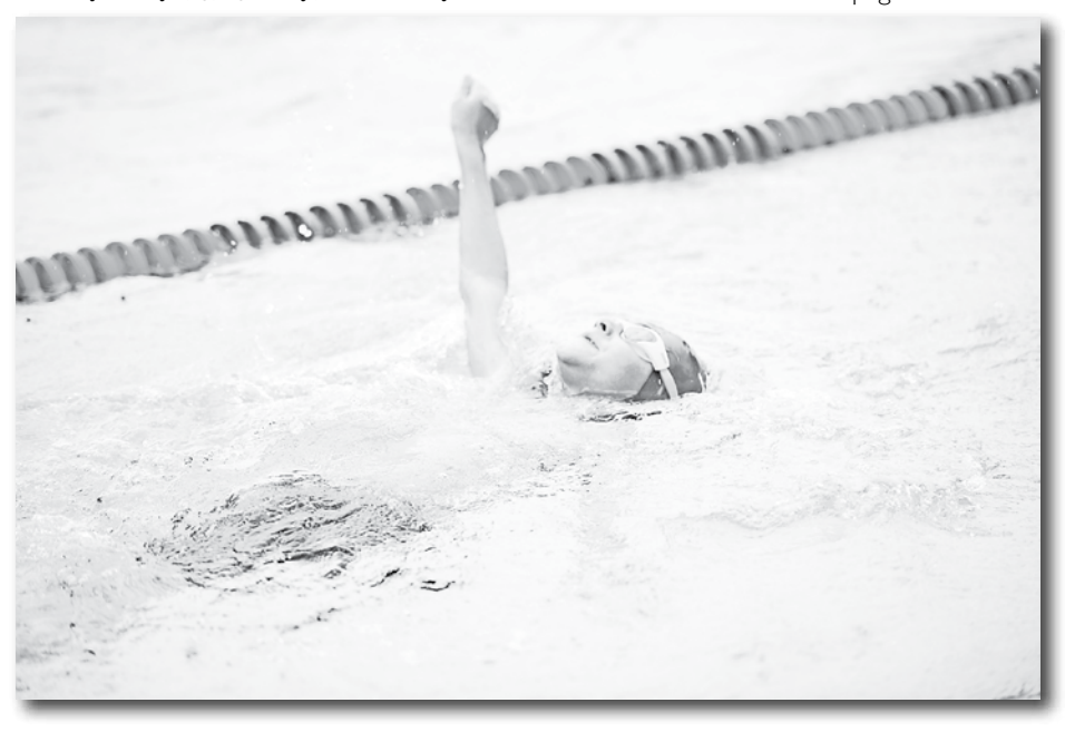
Talon Riddering (10) was named Beast of the Week for his hard work during the week and accomplishments at the meet.