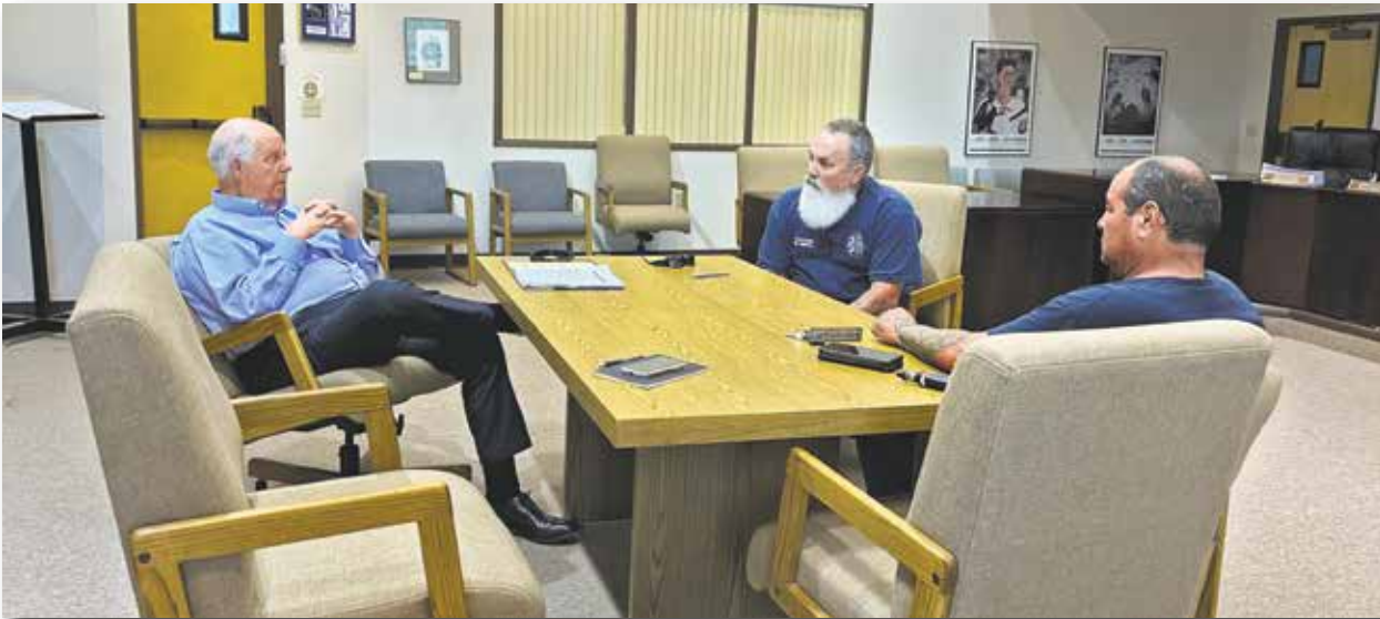
Top photo: Congressman Tom O'Halleran presents a check for more the $417,000 to the Town of Kearny and CopperNet for improvements to broadband internet. Above: The congressman meets with officials from the Town of Hayden.

On Friday, Congressional District 1 Representative Tom O'Halleran visited the communities of Superior, Kearny and Hayden.