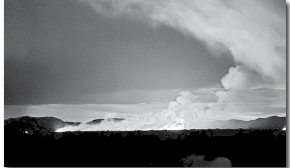
The Bowl Creek Fire near Oracle Junction burned 1,000 acres.