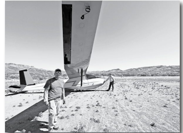
Gliders at the Superior Municipal Airport.

is our first business venture and we are on the list to receive a federal earmark for the hydrants and the water infrastructure to the BTA (Boyce Thompson Arboretum).”