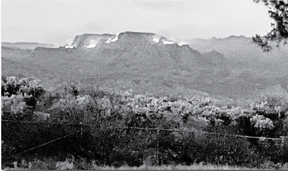
The Red Field Fire in the Galiuros burned approximately 750 acres on Thursday.