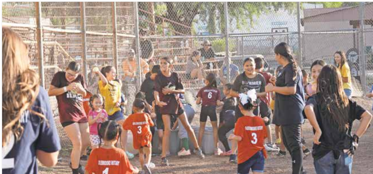
Buckets of water balloons were there for any and all to use in an effort to keep cool at the Summer Softball Closing Ceremonies. Teams from Oracle, Mammoth, San Manuel, Hayden and Kearny participated.