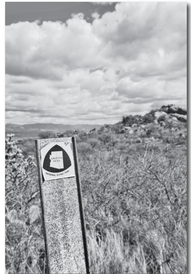
A sign on the Arizona Trail.

The Neighborhood Information Meeting will be held on Thursday, August 5, 2021 at 6:00 p.m. in both virtual and physical format in Florence, AZ at: Ocotillo Room Development Services Building 85 N Florence St, Florence, AZ 85132 You can join the virtual Google Meets meeting by using this link: meet.google.com/tie-kkeq-dow MINER, CBN, SUN Legal 7/21/21