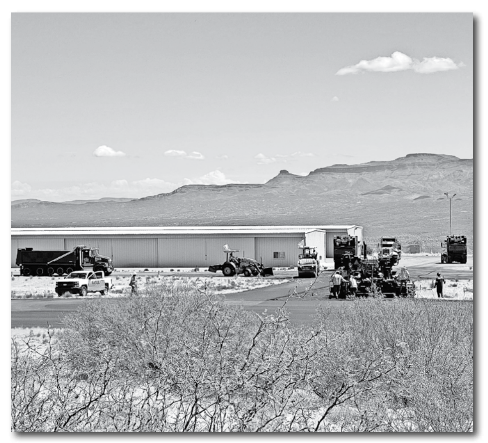
The runway at the San Manuel Airport received a new surface and new paint.