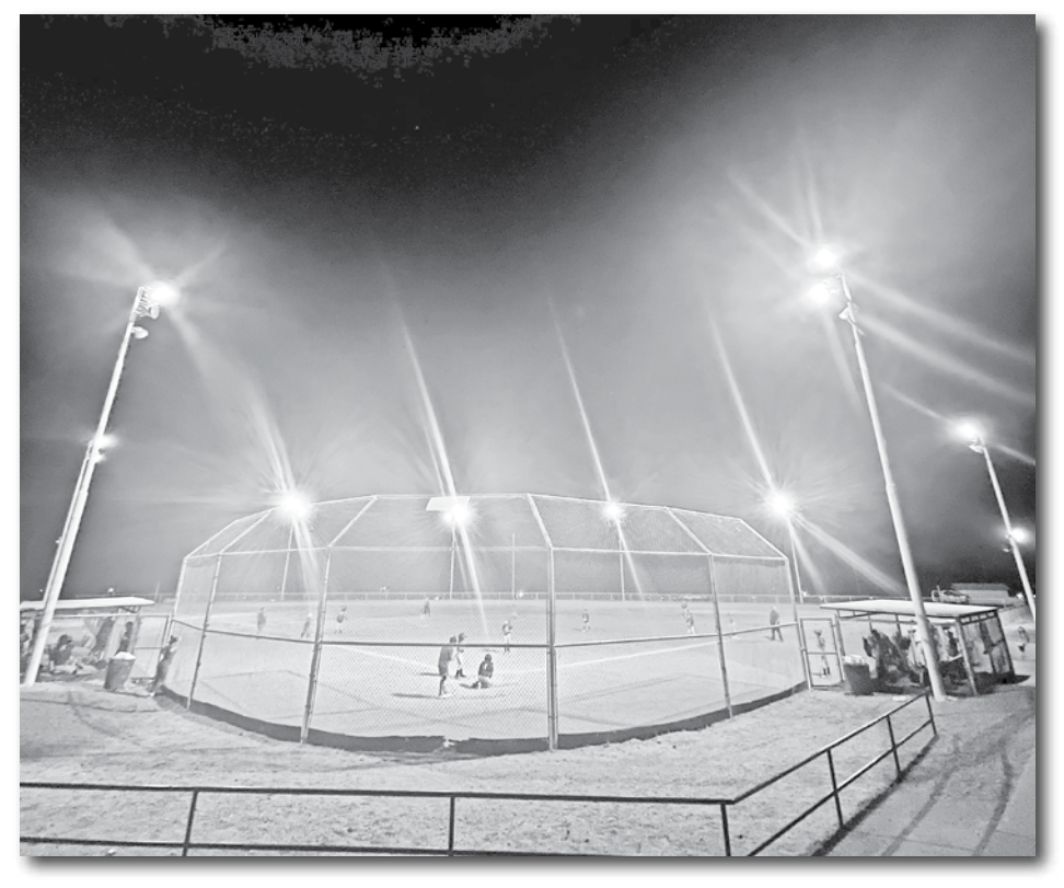
Little League and softball games have made a return. It's great to see the lights on.