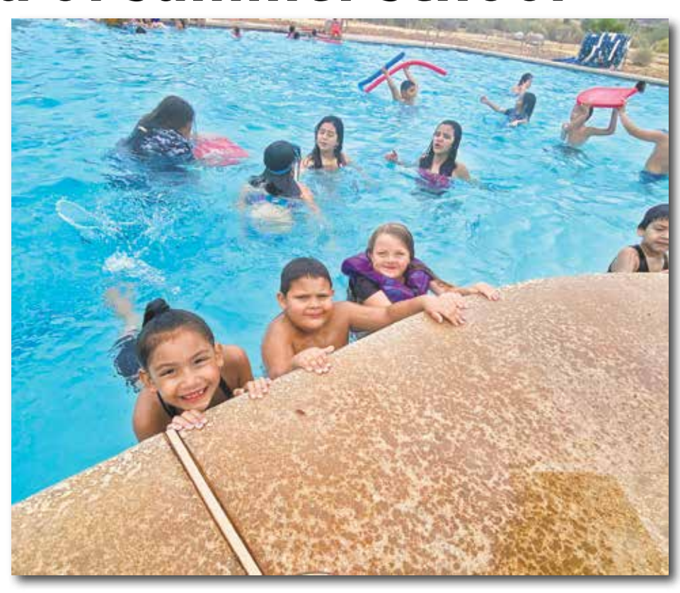
Students from the Hayden-Winkelman Unified School District traveled to Superior to celebrate the end of their 2022 Summer School season. The students enjoyed a morning of splashing and swimming at the Superior Municipal Pool.