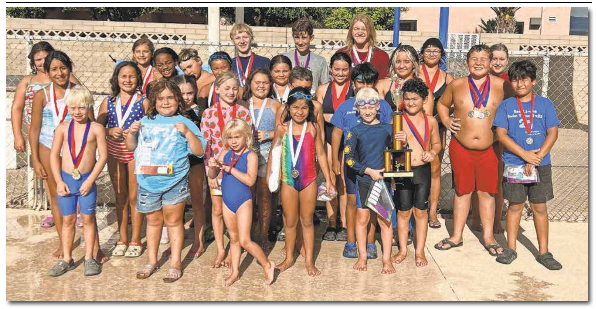
The 2023 Sea Lions Swim Team.