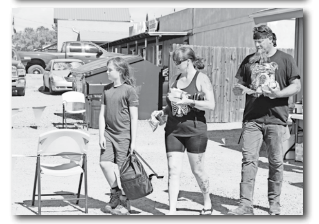
Family First Family Diaper Bank Monday hosted the annual Hot Diggity Dogs. Kids who attended received a hot dog, chips, drink and a backpack filled with school supplies. Families from the Tri-Community were able to participate. Many of the filled backpacks were donated by Vista de la Montana Methodist Church.