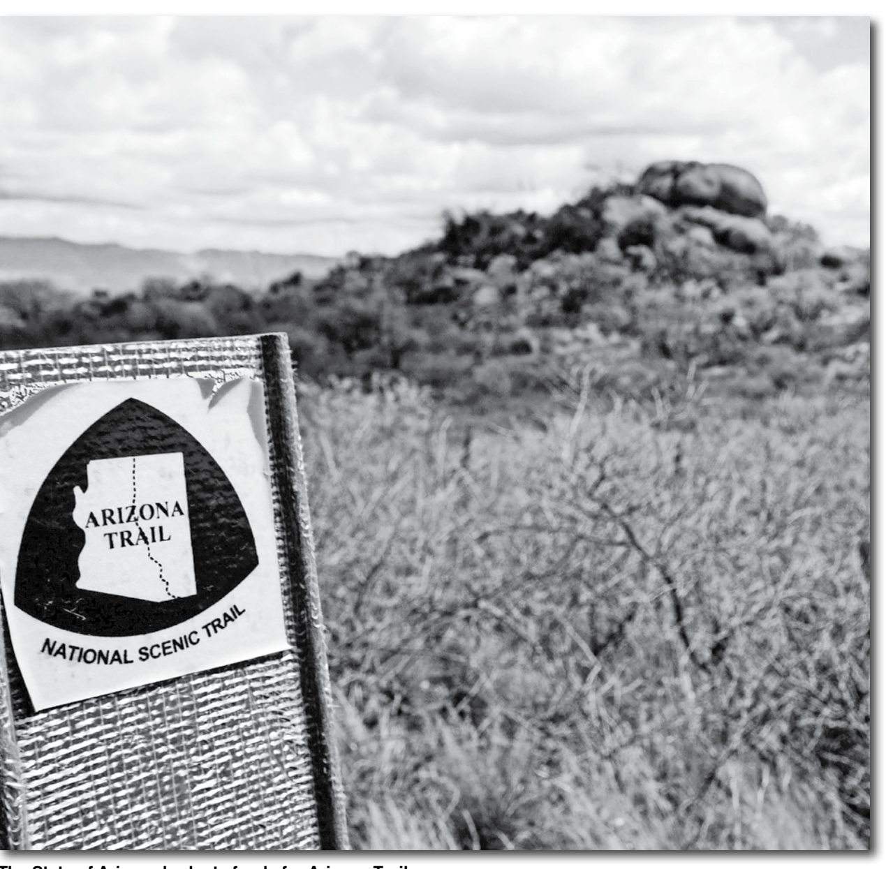
The State of Arizona budgets funds for Arizona Trail.

The organization was incorporated in 1994 with the mission to protect, maintain, enhance, promote and sustain the 800-mile non-motorized Arizona National Scenic Trail as a unique encounter with the natural environment. For more information, visit aztrail.org.