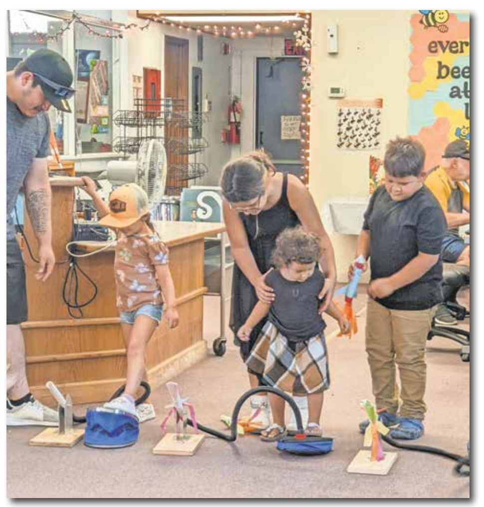
The Hayden Library had the Arizona Science Center brought Stomp Rockets to the library on July 7. Kids made their rockets out of paper and launched them using foot-powered air pumps.