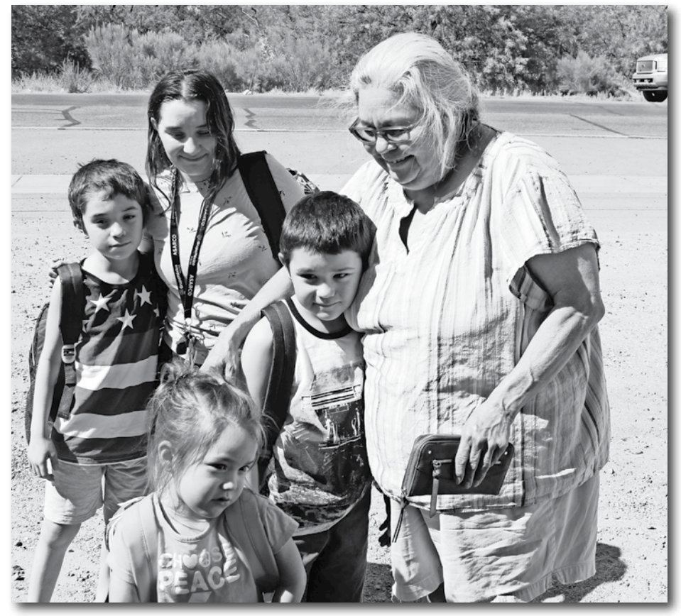
Family First Family Diaper Bank Monday hosted the annual Hot Diggity Dogs. Kids who attended received a hot dog, chips, drink and a backpack filled with school supplies. Families from the Copper Basin including this sweet family from Winkelman were able to participate.

The Ray Bearcats Football Boosters hosted its first Car Wash Fundraiser earlier this month. NAPA Auto Parts played host for the football players and Booster Club members willing to clean cars for a great cause.