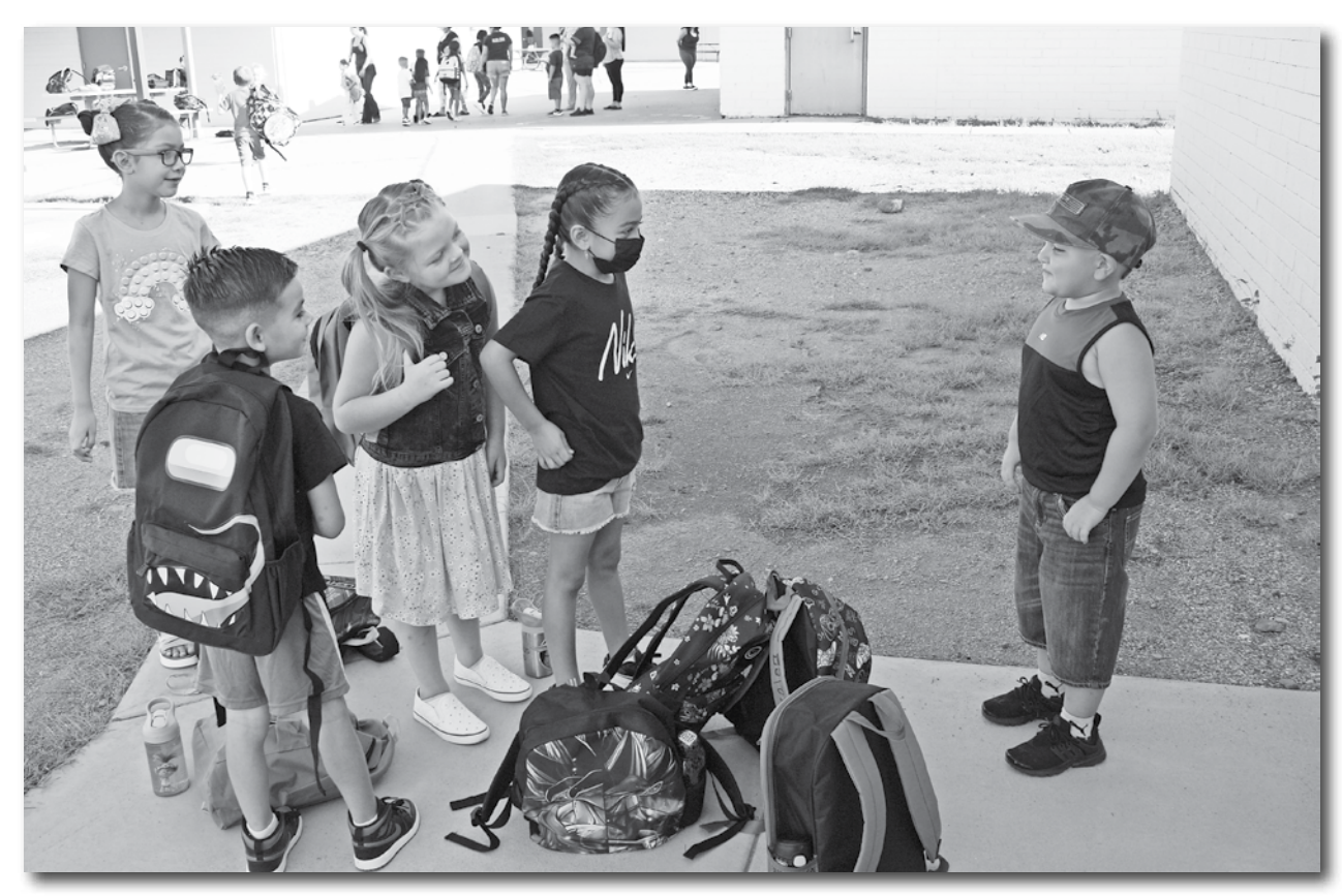
It's nearly time for the kiddos to head back to school. Are you ready?

(utility bill with physical address) and the child to be tested.