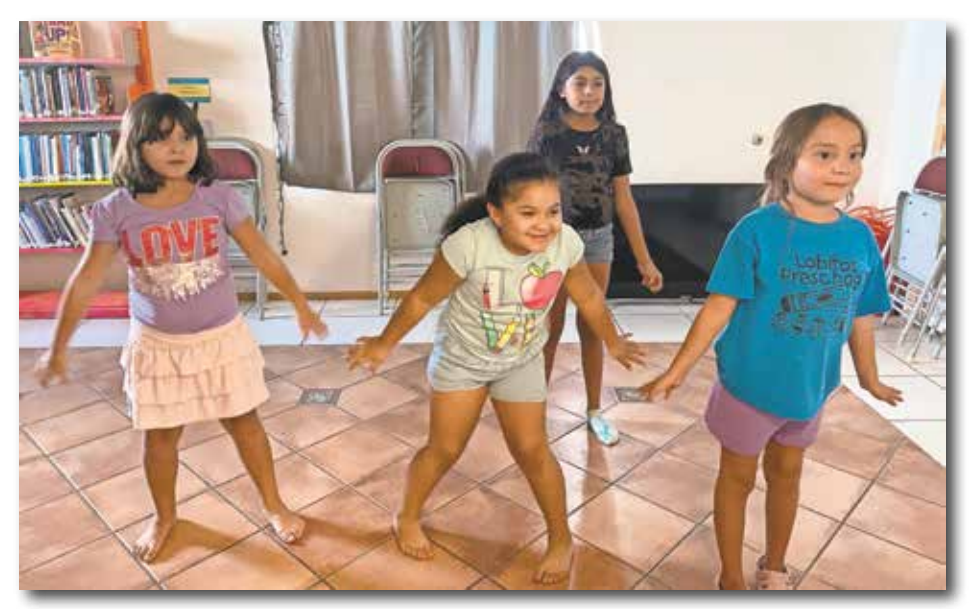
Several little girls got their groove on July 11 at the kids ZUMBA class, which is held every Tuesday and Wednesday from 5-5:30.