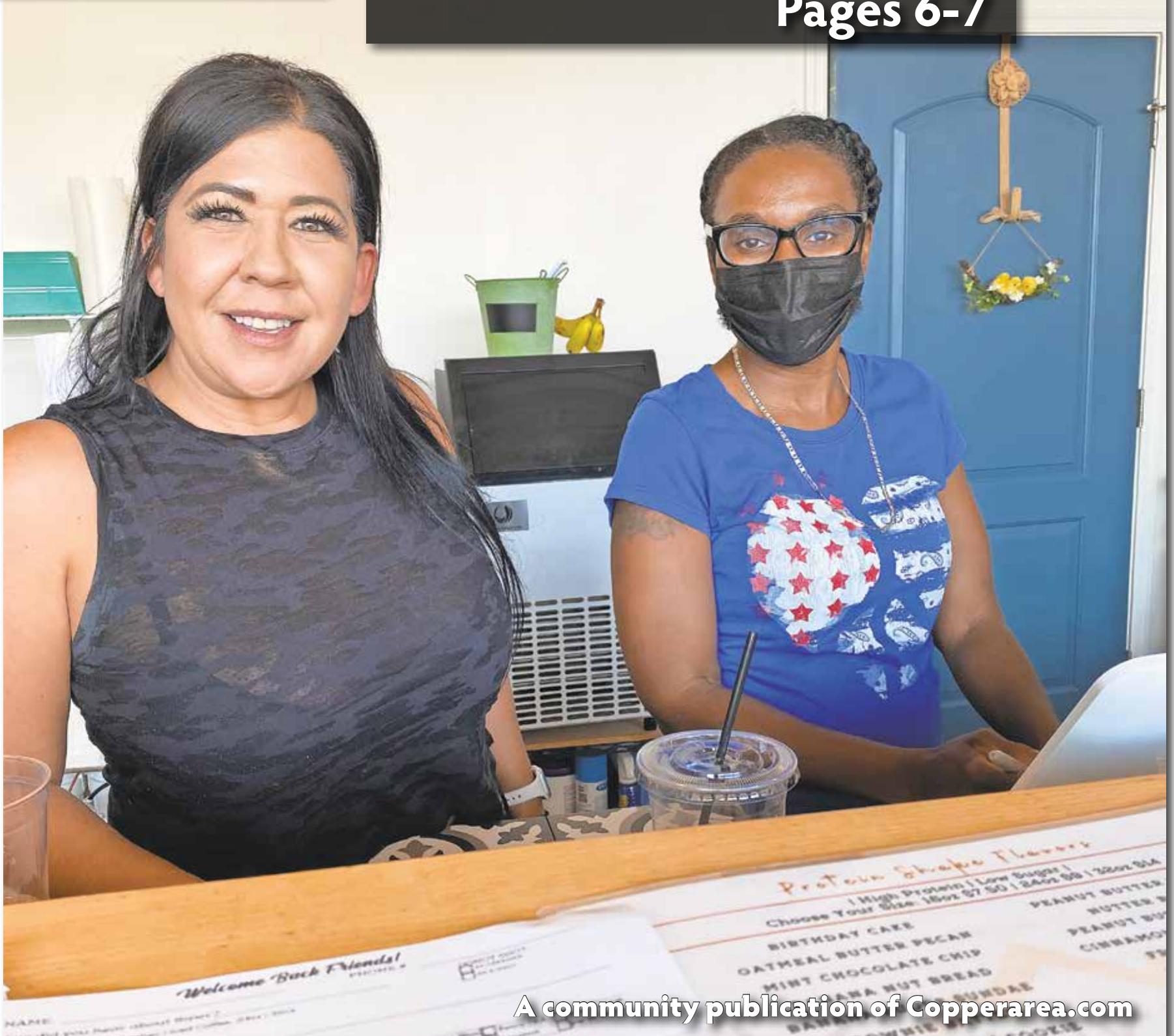
Mila Besich | Sun