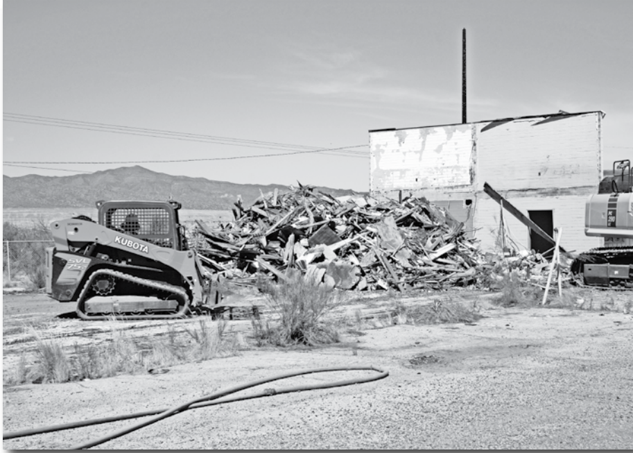
This motel in Hayden was demolished by Gila County with financial assistance from a brownfields grant.

More Arizona communities are leveraging brownfields grants to revitalize blighted properties statewide. Brownfields grants help municipalities and nonprofits identify and reduce environmental hazards, mitigate public health threats, create new business opportunities, increase tax revenues and restore impacted properties to beneficial reuse.