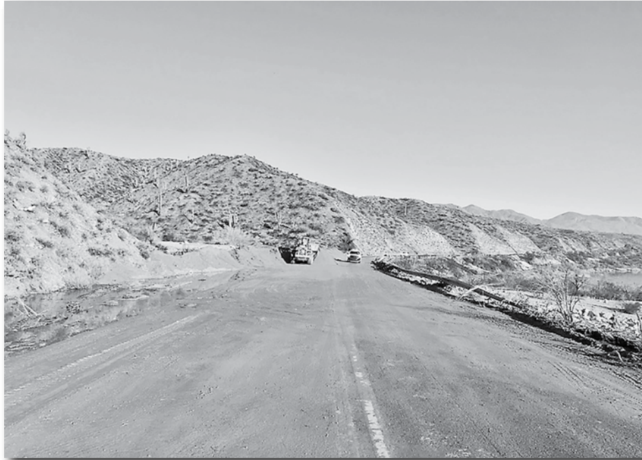
ADOT crews clean up after a flash flood in 2020 on State Route 188.