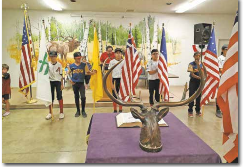
The Kearny Elks celebrate Flag Day with assistance from the Kearny Little League.

If you are interested in joining and volunteering your time with the Elks Lodge # 2478, look online at Elks.org for more information or contact a member of the Elks. The lodge is open Monday, Wednesday and Friday at 5 p.m. Or, call the secretary at 520-827-9409.