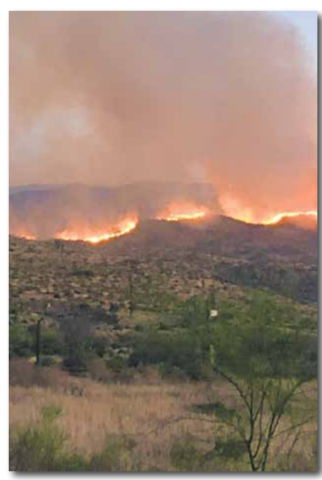
Retardant is dropped on the Telegraph Fire by air support. The blaze nearly burned the Arboretum but additional support came in to save the park.