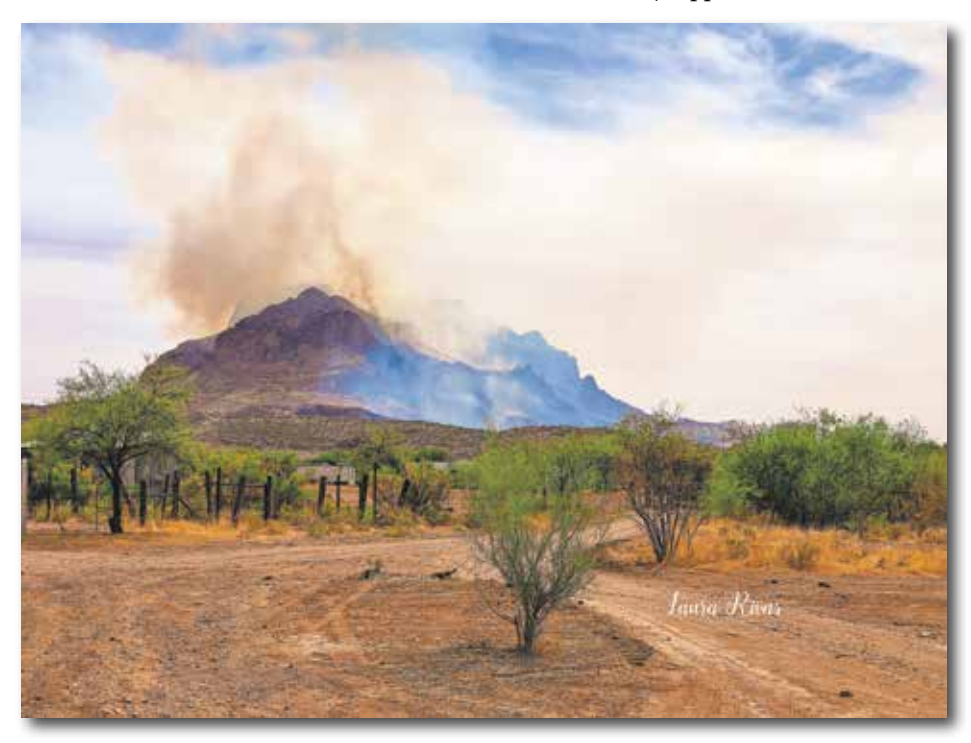
The Telegraph Fire burns near Superior. The fire at press time is zero percent contained with more than 70,000 acres burned.

Keep up to date with road closures and fire news on our Facebook page: www. facebook.com/copperarea.