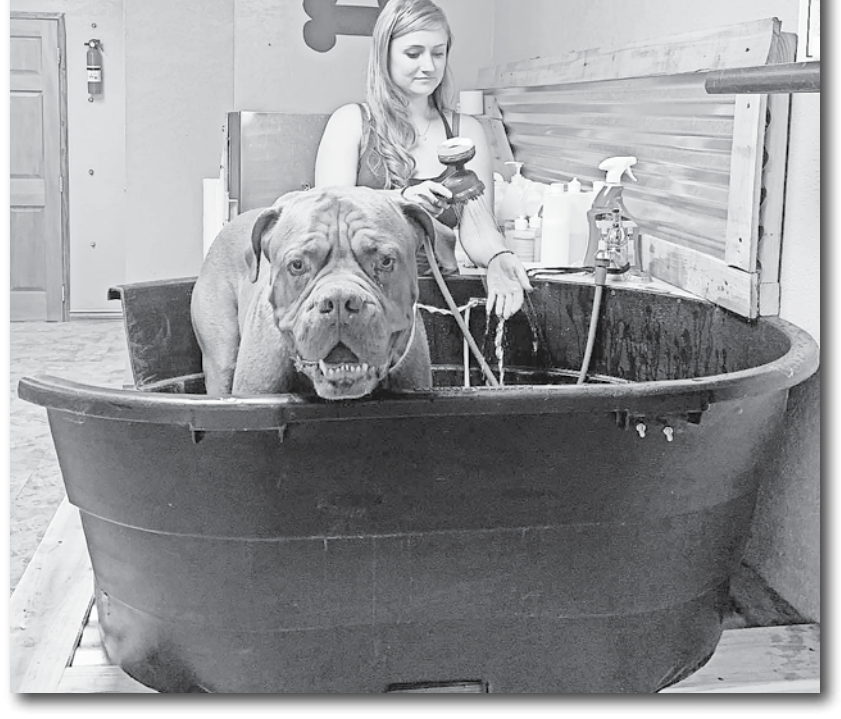
Some satisfied customers.