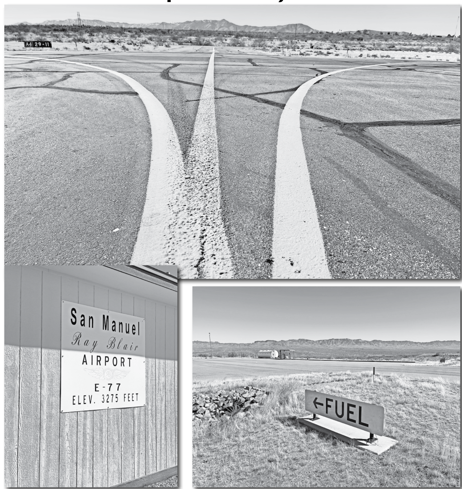
The Ray Blair San Manuel Airport E77 runway will be closed from June 16-23 for resurfacing. The runway will also be closed July 6-7 for striping work.