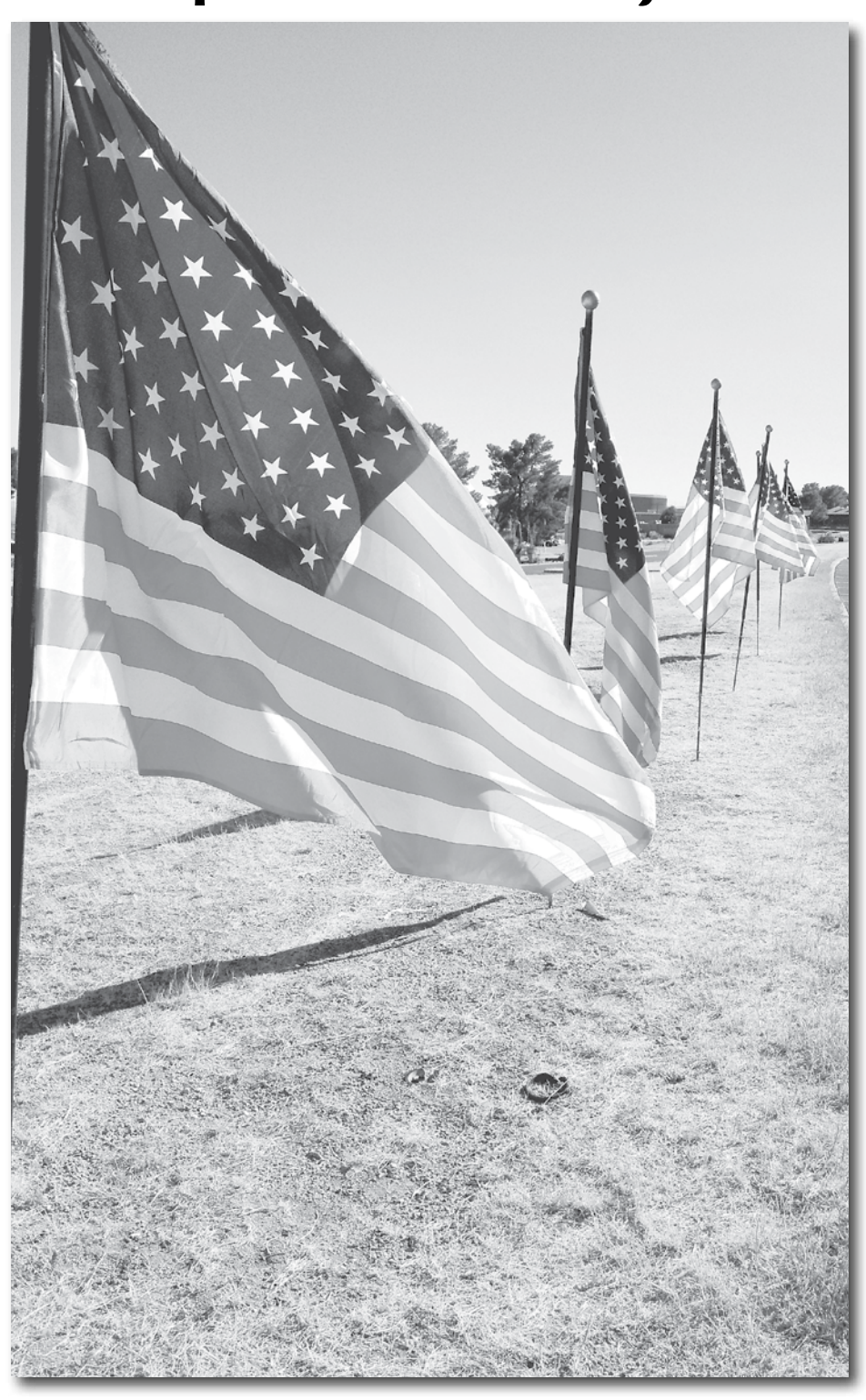
San Manuel Elks will be holding a Flag Day Ceremony along with the VFW Color Guard on Sunday, June 12, from 2-3 p.m. in their Lodge Room. This event is open to the public and all are welcome to join them for this informative and inspirational Celebration of the American Flag. A hot dog lunch will be served afterward for $3 (children eat free) from 3-5 p.m.