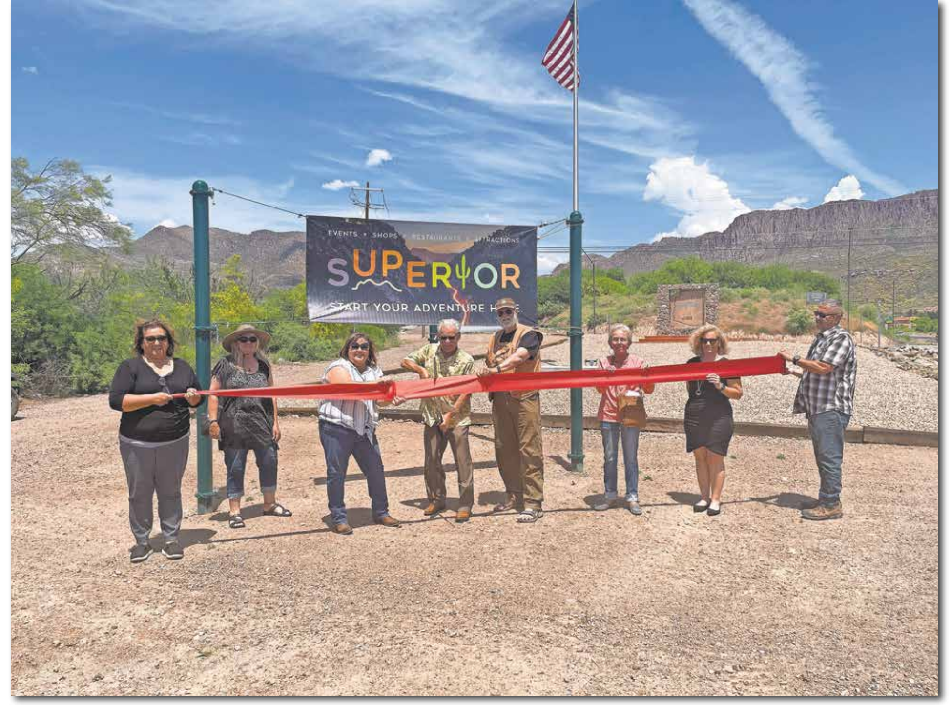
Officials from the Town of Superior and the Superior Chamber of Commerce were on hand to officially reopen the Peace Park at the entrance to the town.

Local groups wishing to install banners on the new entryway banner location will need to submit a permit at the Town Hall.