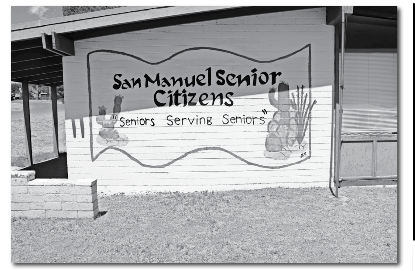
The outside of the San Manuel Senior Center will also receive some much needed attention with the creation of a parking lot and making the outside ADA compliant.