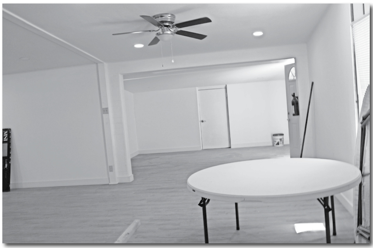
There will be lots of bright open spaces for San Manuel's Senior Citizens once the renovations are complete.