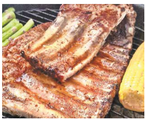
Pork Back Ribs

Purchase a $60 Meat Box & Receive a FREE 1-lb of Homemade Chorizo! (10 Different $60 Boxes to Choose From)