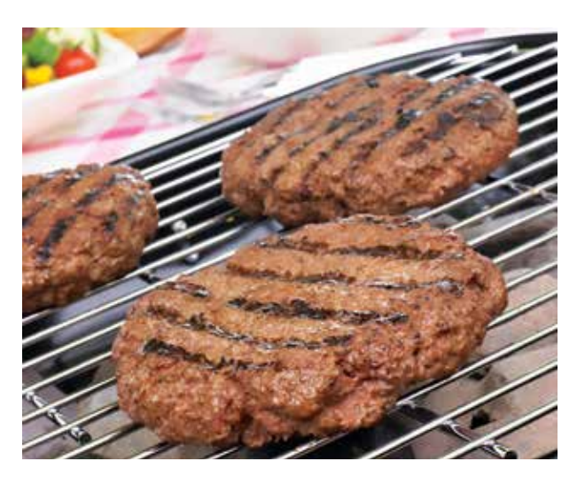
100% Beef Hamburger Patties

Double Pack Tripas Del Lecha ......$2.49/lb Beef Marrow Guts Beef Fajita Steak Strips .....$5.99/lb Marinated Beef Flank Steaks .....$7.99/lb