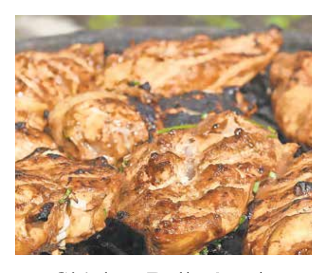
Chicken Pollo Asado Marinated Boneless Chicken