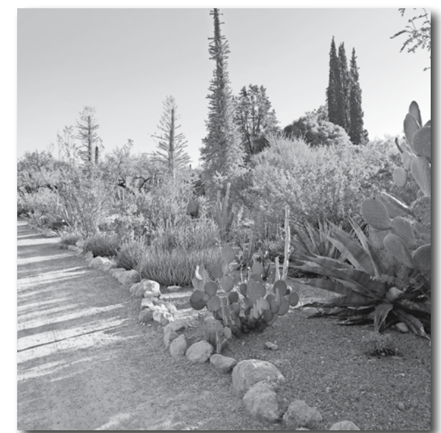
Boyce Thompson Arboretum is a 343-acre park with nearly 5 miles of trails and almost 4,000 plant species to see.