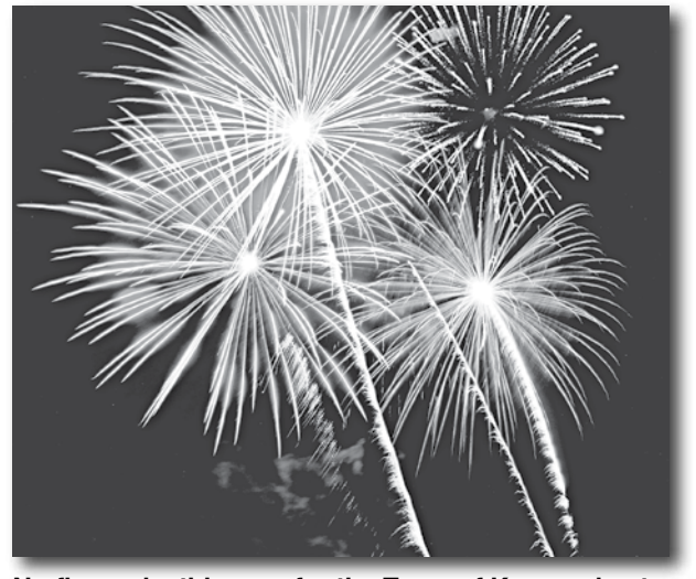
No fireworks this year for the Town of Kearny due to extreme fire danger.

Town of Kearny Administration wishes everyone a safe and happy 4th of July.