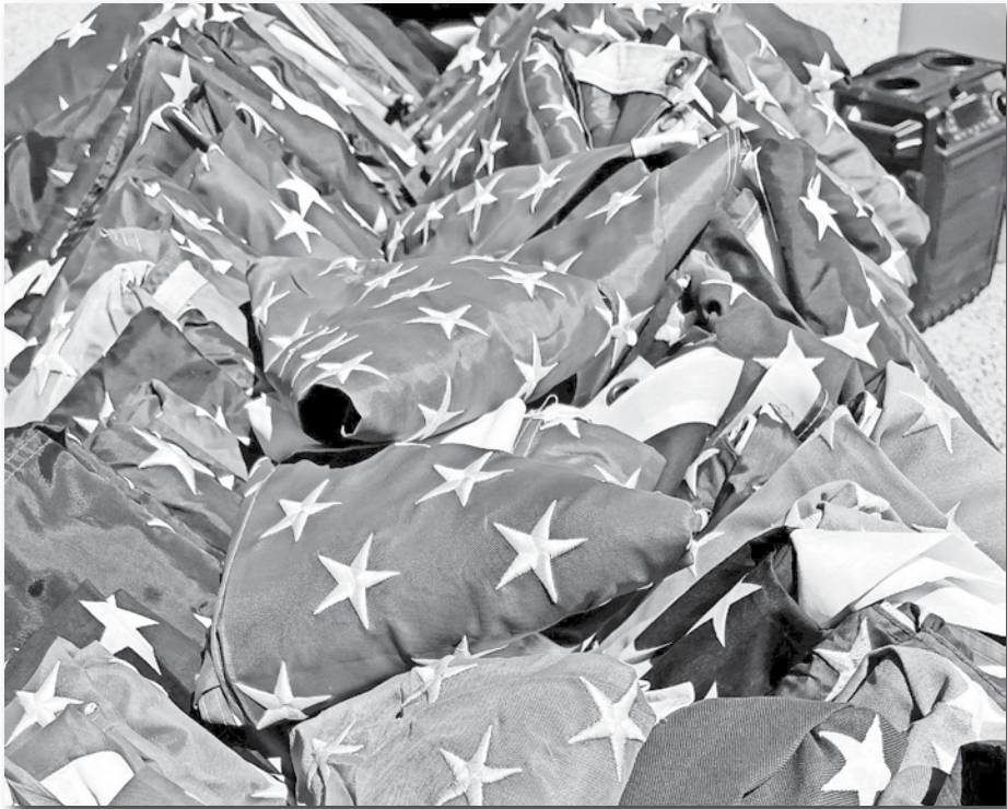
Flags should be retired when they become worn, torn, faded, or badly soiled. Nearly 100 flags were retired at the Flag Retirement Ceremony. T.C. Brown | Miner