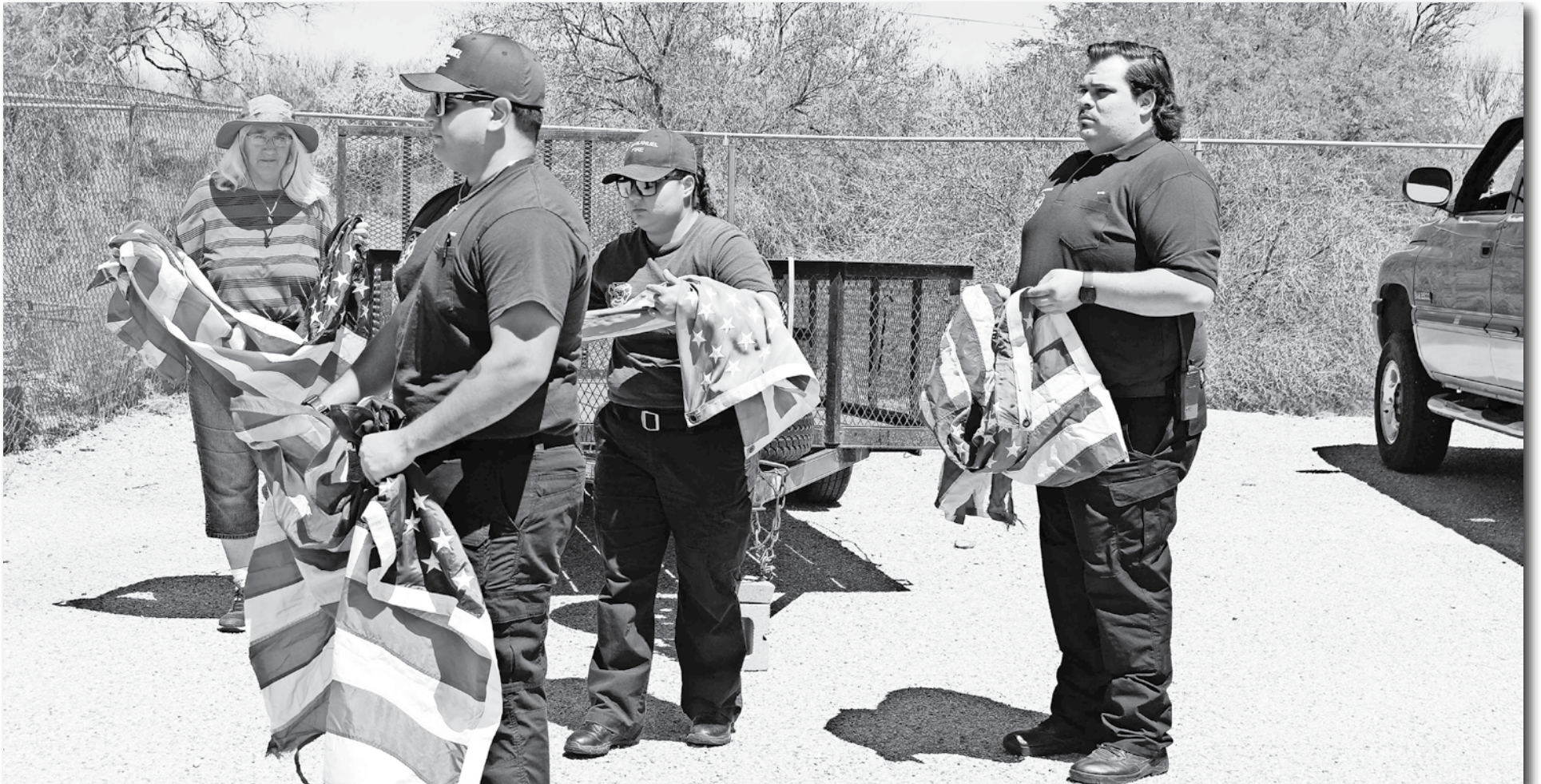
Members of the San Manuel Fire Department and the public participate in the Flag retirement ceremony.