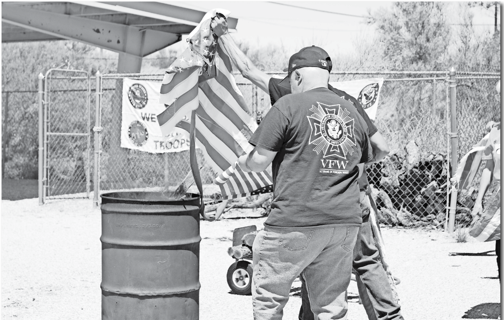
The VFW retires its own tattered American Flag at the beginning of the ceremony.

Community members with unserviceable flags that they wish to be retired can leave them at the Elks Club in San Manuel. Flags may also be left at Peppersauce Motor Sports in San Manuel in preparation for the next Flag Retirement Ceremony.