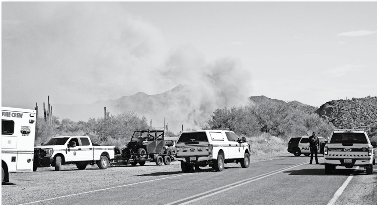
Local and fire crews from all over help battle a brush blaze near Riverside Sunday afternoon. There were no reports of any structures being burned but one firefighter said it got close.

Local police and fire agencies assisted with the fire including Kearny, Superior, Winkelman along with the Arizona State Department of Forestry. The fire burned 250 acres and was stopped from spreading at the ASARCO Ray Pit.