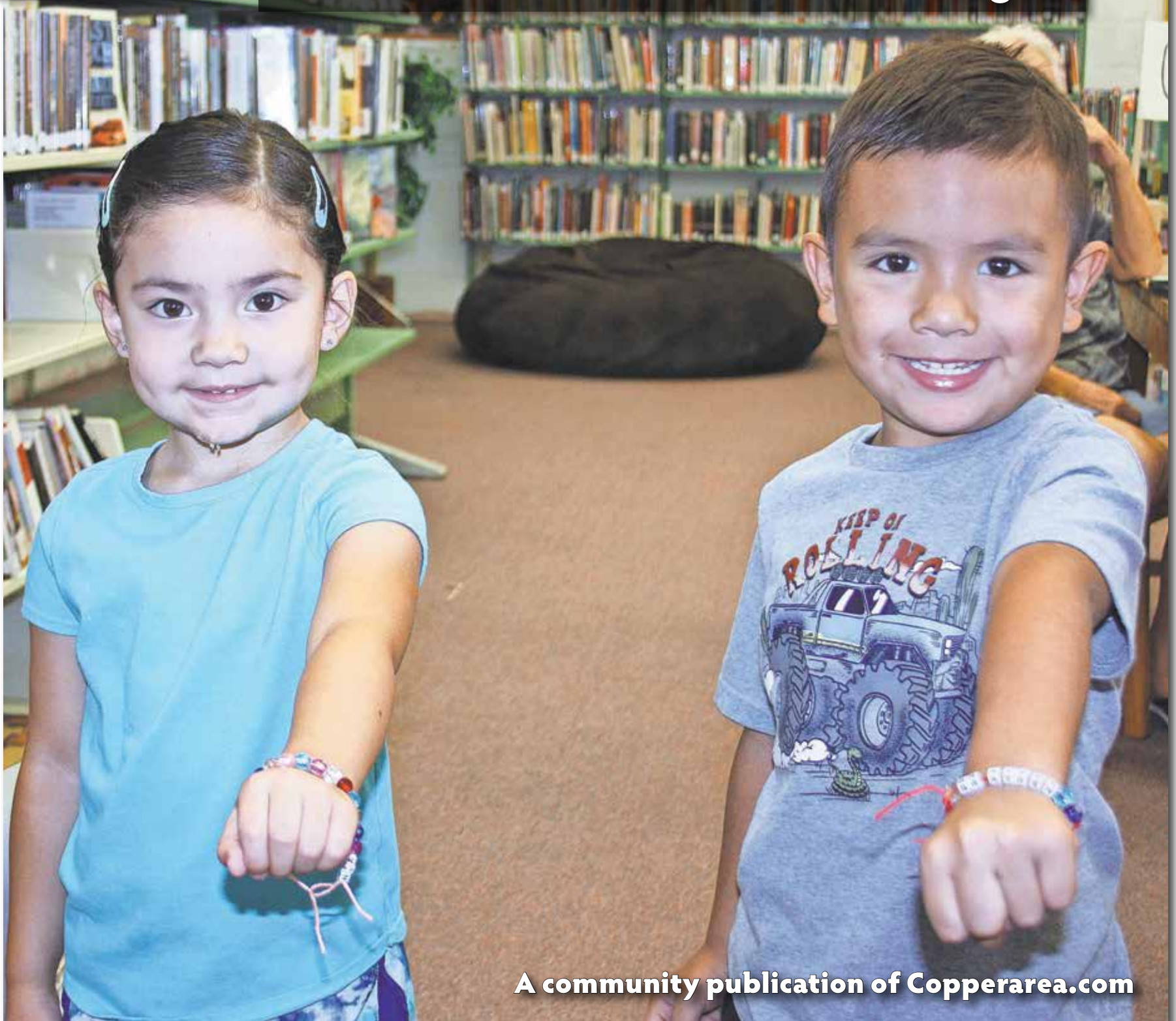
James Carnes | Copper Basin News