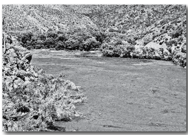
Photo above shows the Big Box Lake in 2019. The dam can be seen at the extreme bottom edge of the photo. Below is the Big Box Lake following the Telegraph Fire.