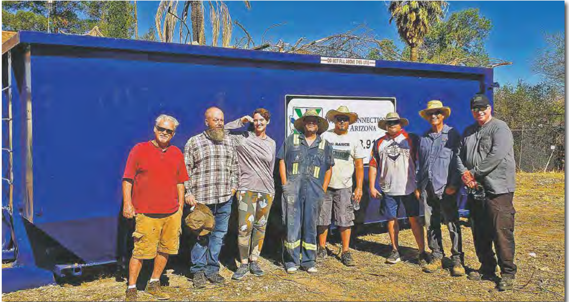
Rebuild Superior Inc. hosted a neighborhood cleanup on Sonora Street.