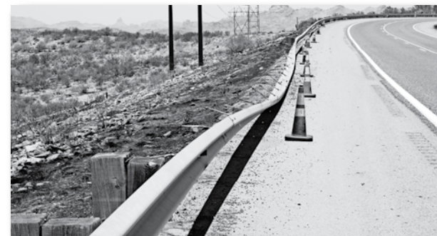
The guard rail posts were burned in several places on Hwy. 177 between Kearny and Superior.