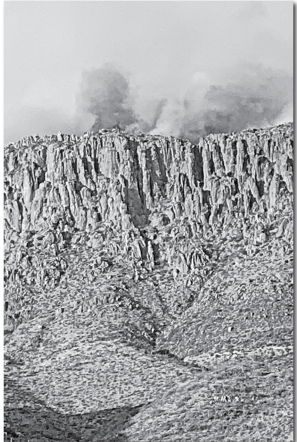
Smoke rises over Apache Leap.

The Telegraph Fire has become one of the top 10 largest fires in Arizona's history. Copper Area News provides a variety of updates regarding the fire on our Facebook pages; residents can also follow the Telegraph Fire Incident Command Facebook page and website for additional information.