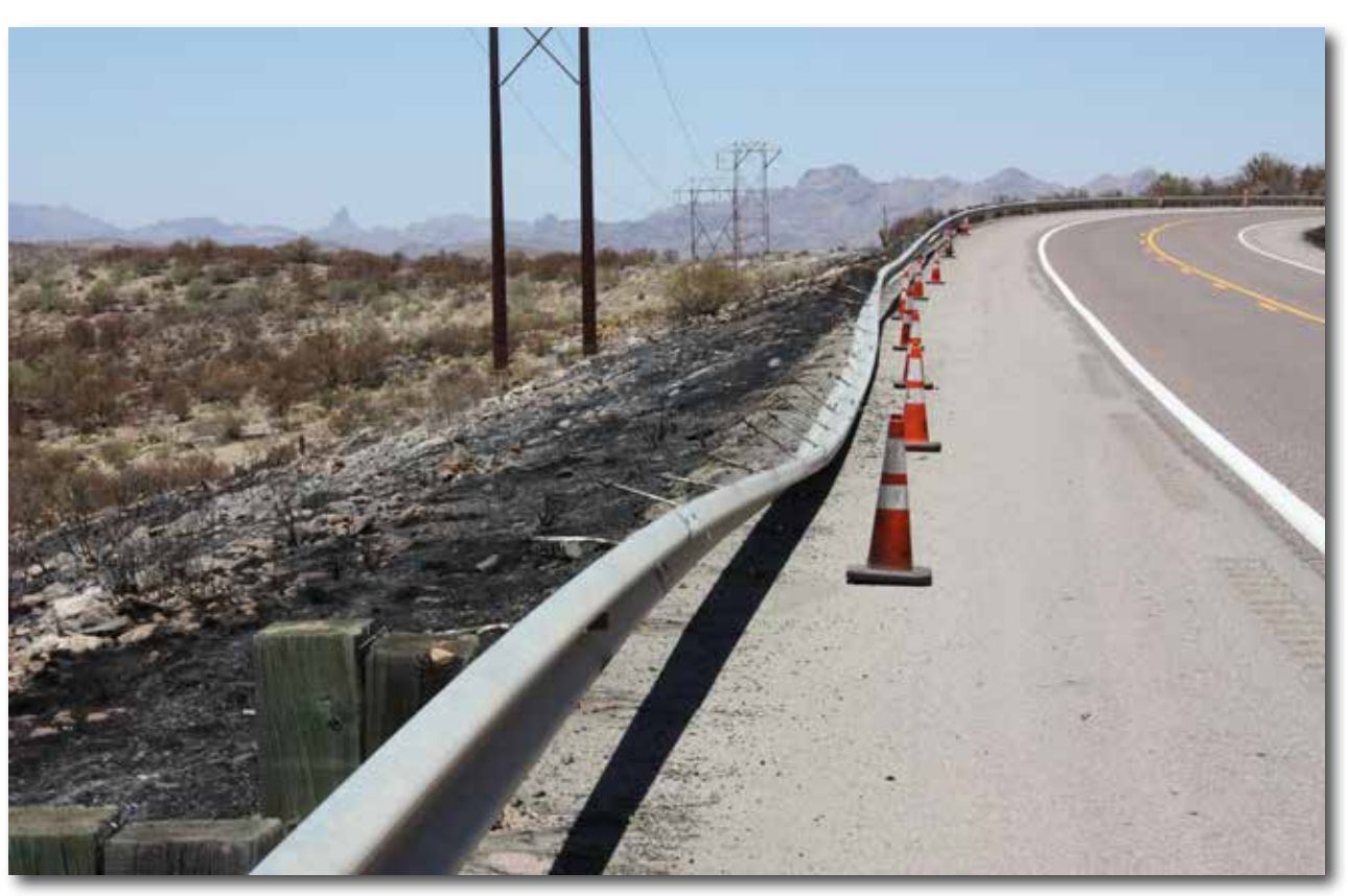
The guard rail posts were burned in several places on Hwy. 177 between Kearny and Superior due to the Telegraph Fire.

The Telegraph Fire has become one of the top 10 largest fires in Arizona's history. Copper Area News provides a variety of updates regarding the fire on our Facebook pages; residents can also follow the Telegraph Fire Incident Command Facebook page and website for additional information.