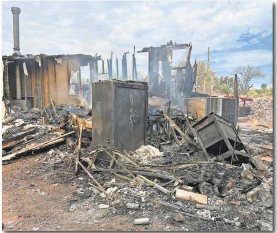
The home was declared a total loss after a structure fire in Mammoth.