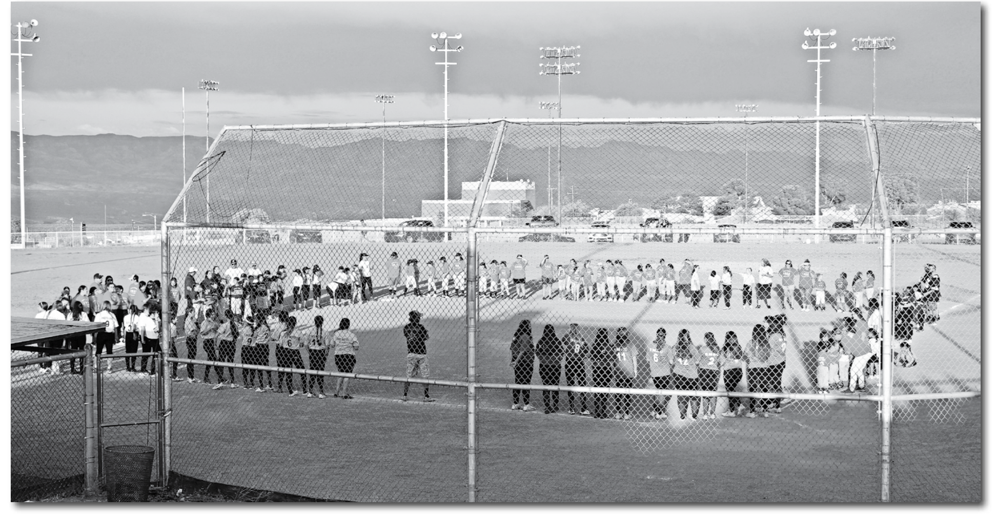
The Summer Softball League hosted opening ceremonies on Saturday in San Manuel. The League encompasses girls from Hayden, Mammoth, San Manuel and Oracle.