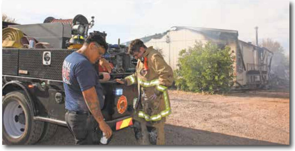
Firefighters take a break to cool off during the battle to extinguish a structure fire in Mammoth.

Firefighters continued to monitor the incident for any hot spots that occurred. The cause of the fire is unknown.