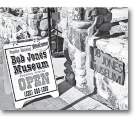
Bob Jones Museum Hours

Effective May 1 - Sept. 30 a BURN BAN is in effect for the Dudleyville Volunteer Fire District which includes the area of Dudleyville, Indian Hills and Aravaipa. Burn permits for both residential and agricultural purposes are not valid during this time.