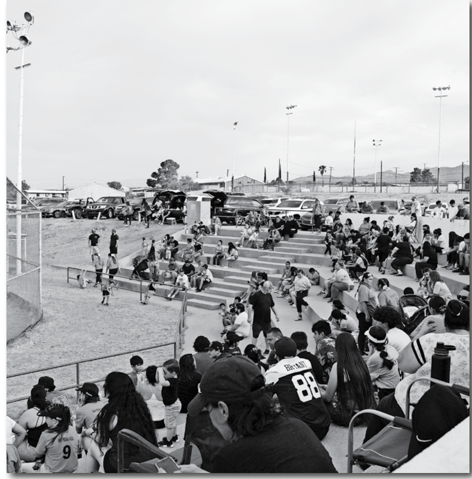
The stands were full of fans ready to cheer on their team at the opening of the Summer Softball League.

Sponsors of this season's Summer Softball League include 7 Sky Motel, Silver Mountain Mining, Oracle Ford, CheetoVibez Smoke Shop, Salt N Pepper, Downtown Hardware, SaddleBrooke Community Outreach and San Pedro Valley Pizza Co.