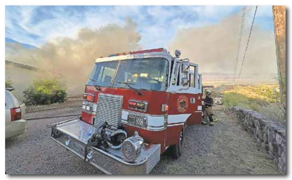
Firefighters from four departments battled a structure fire in Mammoth.