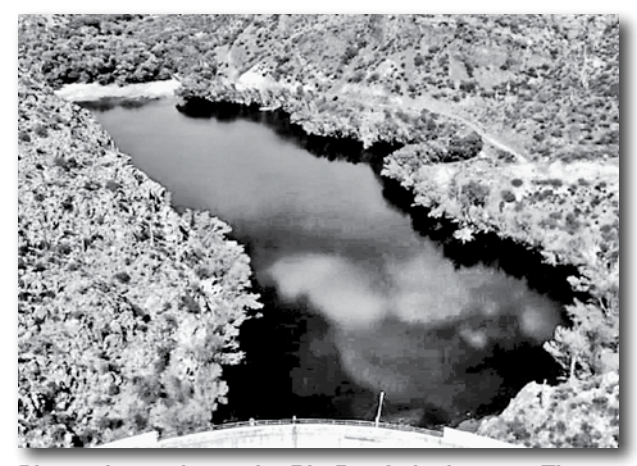
Photo above shows the Big Box Lake in 2019. The dam can be seen at the extreme bottom edge of the photo. Below is the Big Box Lake following the Telegraph Fire.