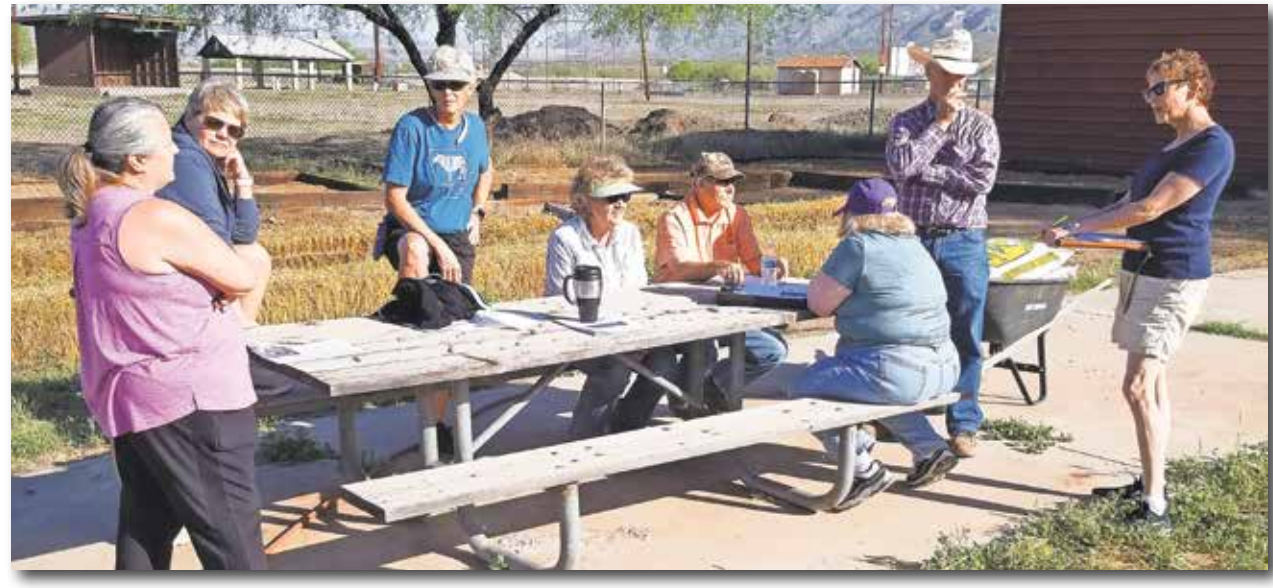
Organizers and volunteers at the Kearny Public Garden.