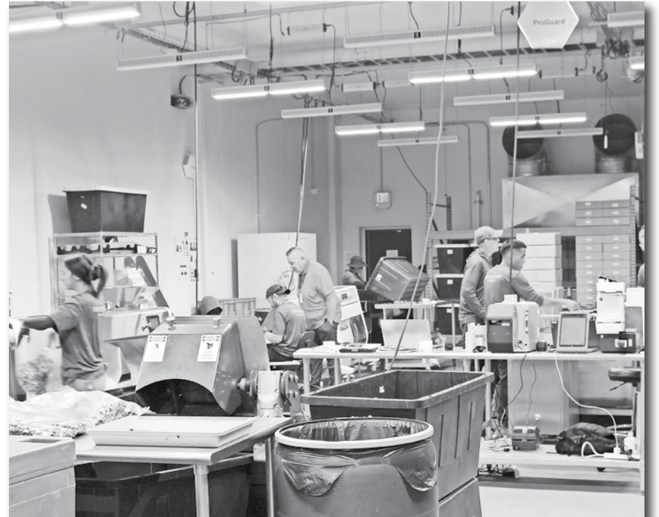
Flower Mine production room.