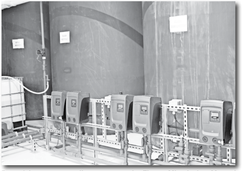
Part of the water recycling system at the Flower Mine in San Manuel.