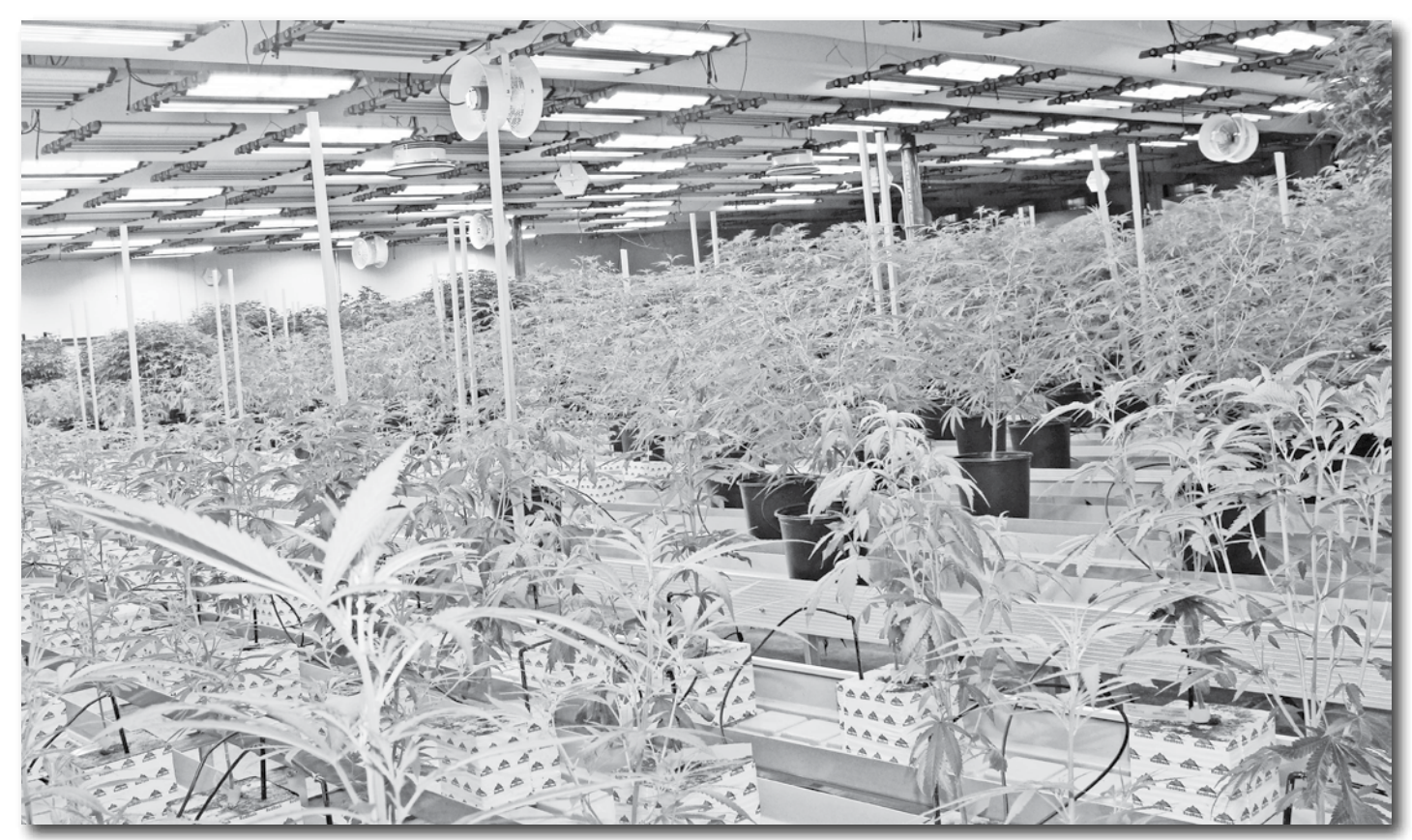
The Flower Mine in San Manuel boasts 100,000 square feet of growing space.