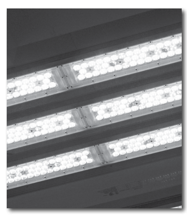
The grow lights are the strongest and most efficient on the market and are patented by the company.