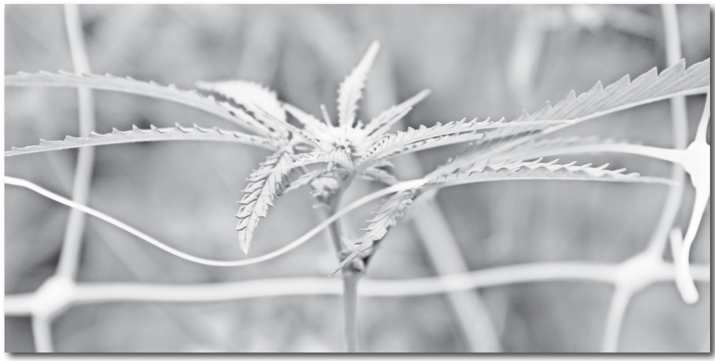
A close up of the plants grown at the Flower Mine in San Manuel.