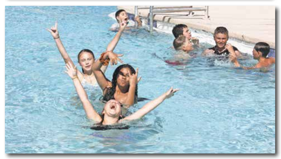
The Hayden and Kearny pools are open for the summer and kids of all ages are taking advantage and staying cool in the summer heat.