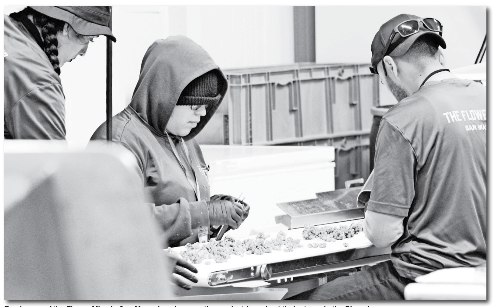
Employees of the Flower Mine in San Manuel package up the product for sale at their stores in the Phoenix area.