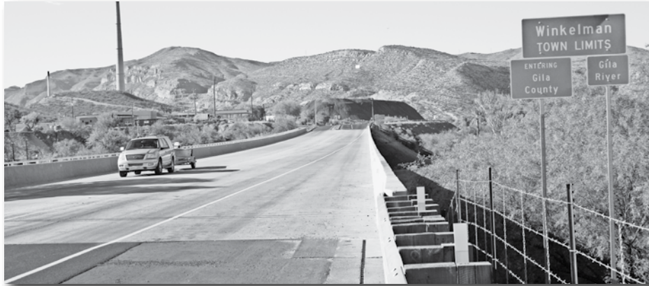
No more waiting. Traffic from both directions are now allowed to use the new Winkelman bridge at the same time.

The new 761-foot-long bridge carries two lanes of traffic over the Gila River, along with a wider pathway for pedestrians and bicyclists.