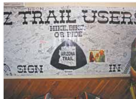
Old Time Pizza is Arizona Trail Users sign in stop.