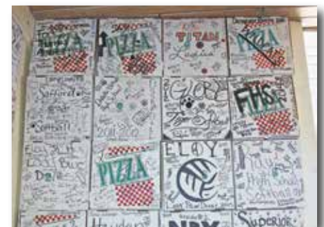
Lots of signed pizza boxes are posted in the place from visitors from all over.