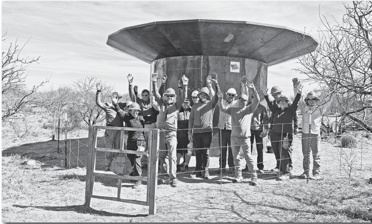
Volunteers celebrate the installation of a rainwater collector.