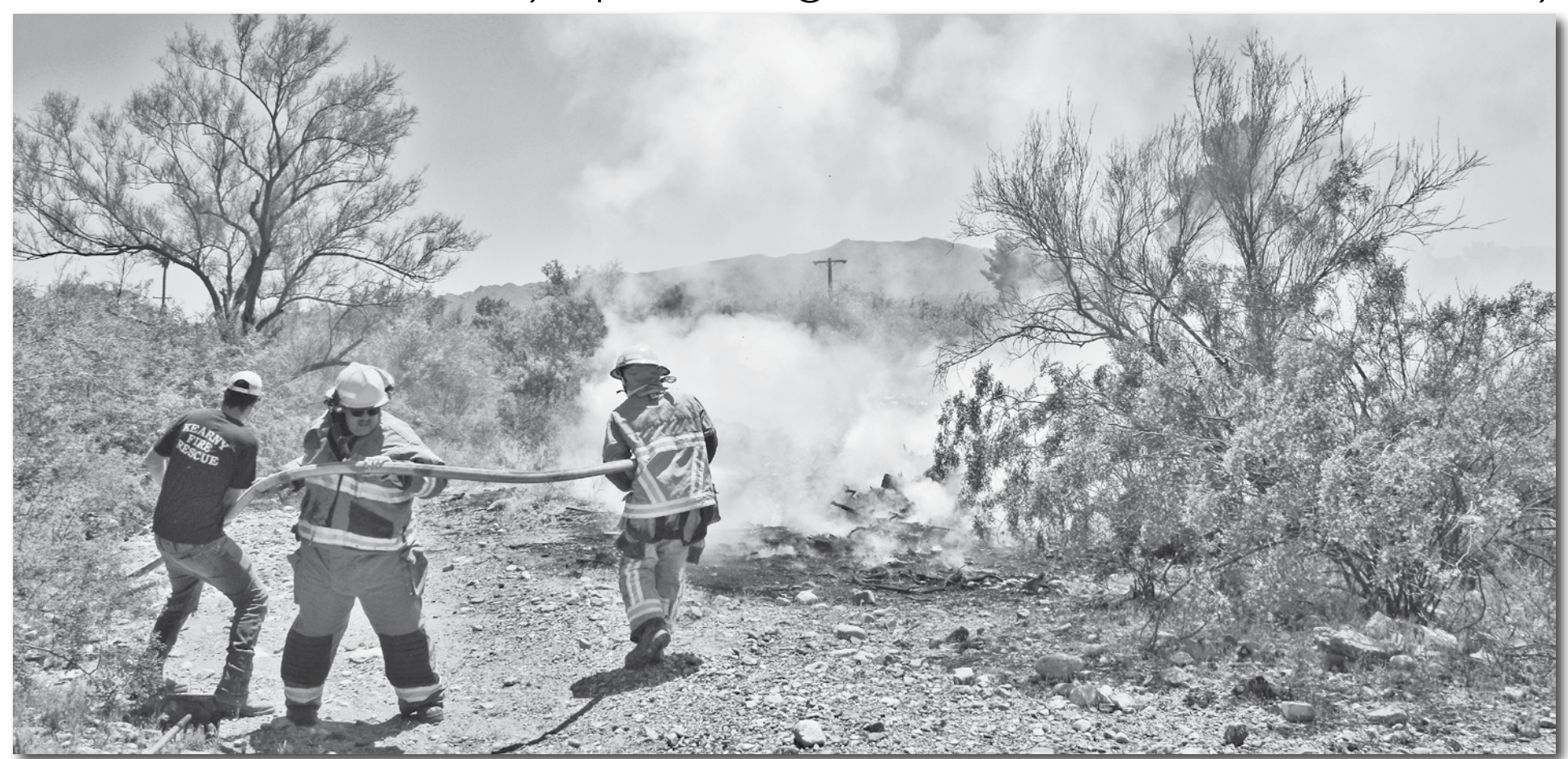
A brush fire was quickly brought under control by Kearny Volunteer Fire Department Saturday morning. The fire started near the Church of the Good Shepherd just off Shake Drive. With the desert growth from recent rains, it could have spread rapidly without the prompt attention from the local fire department.