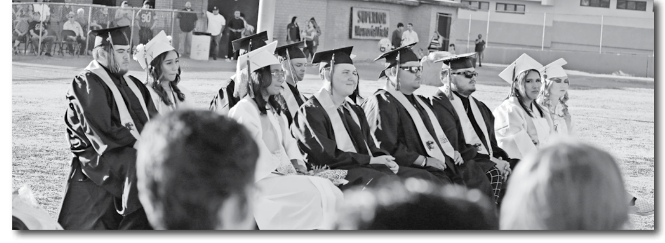
Graduates listening attentively to speakers.