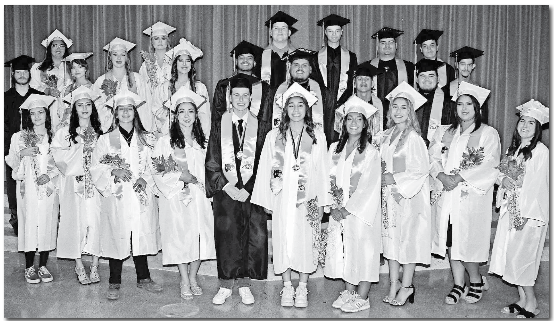
Superior High School Class of 2023.