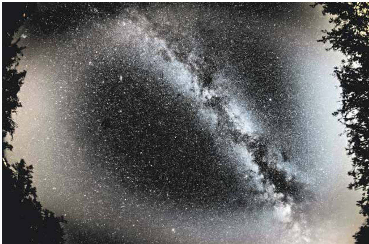
The Milky Way as viewed from Oracle.