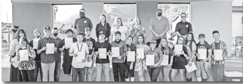
The Superior Town Council honored graduating seniors in annual Key Ceremony.