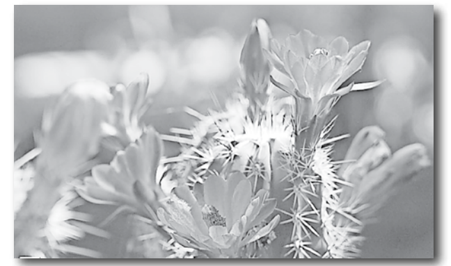
The Hedgehog Cacti is an endangered species.

The rescue effort required several of the members of the Desert Botanical Garden team to rappel into the canyon, Continued on page 9