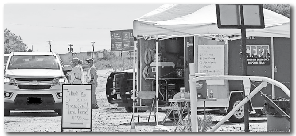
Oracle Brush Dump operations on the May 1 Free Dump Day.