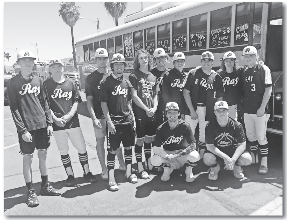
The Bearcats baseball team received a wonderful send off Saturday as they headed to play in the state tourney. Fans, friends and families cheered the boys as their bus departed the school.