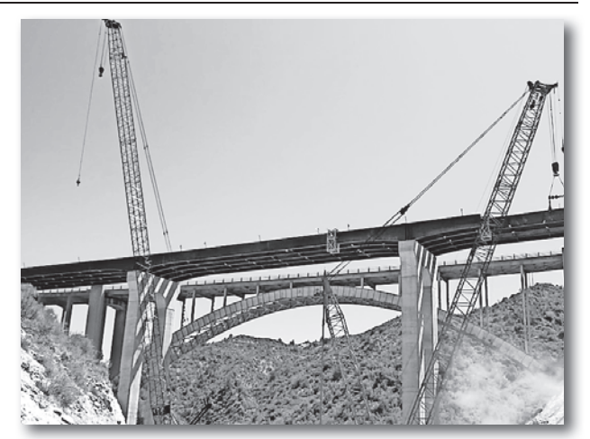
The Pinto Creek Bridge project between Superior and Globe goes right through the natural habitat for the endangered Hedgehog Cactus.

"Not only will we be able to return the rescued cacti to the site once the project is done, but we will have more cacti than when we began," he added. "Because part of this process is to hand pollinate the plants at the garden complex and we are also able to clone the mother plants. This is a great win for the environment." For more information on ADOT Environmental Planning: azdot.gov.