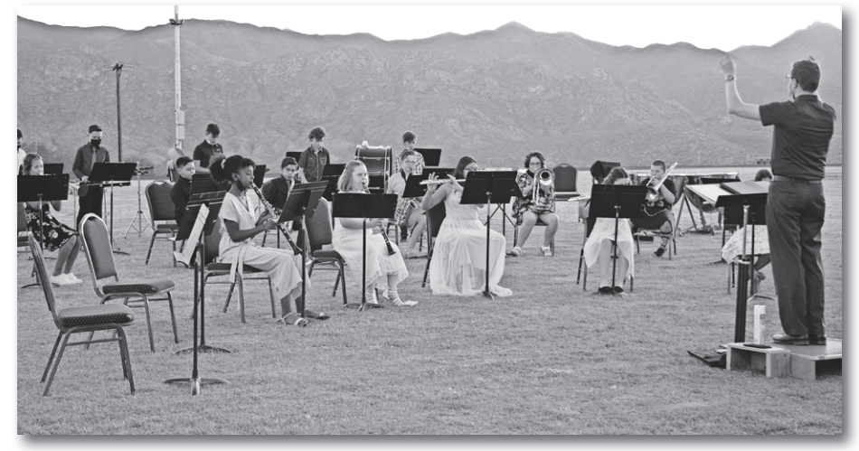
The fifth and sixth grade bands perform at the concert Thursday night at the football field.