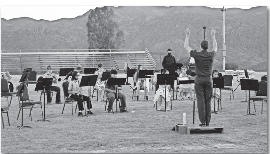
The 6th grade band performs at the concert.