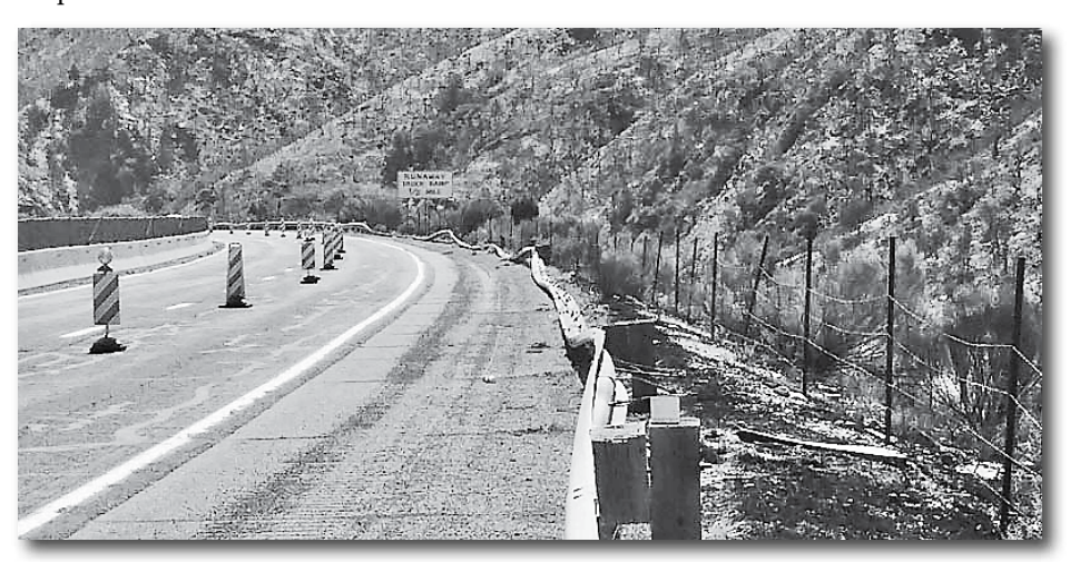
Guardrails on SR 87 south of Payson damaged by wildfire in 2020.