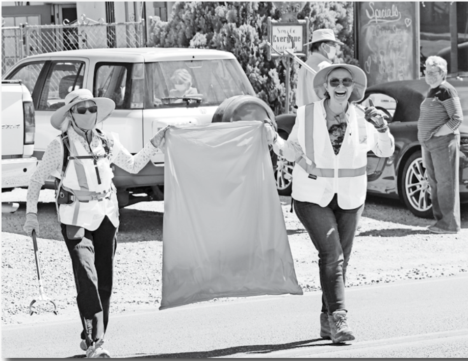
On Sunday, April 25, volunteers organized by the Oracle Community Center and OWN (Oracle Women's Network) teamed up to clean up American Avenue in Oracle. Following the work party, volunteers were treated to lunch and live music at the Oracle Community Center.