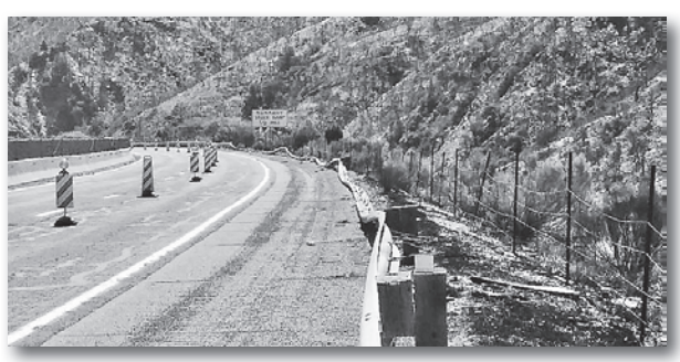
Guardrails on SR 87 south of Payson damaged by wildfire in 2020.

up making it a 2-2 tie. Although, the tie only lasted until the Lady Bearcats took bat, scoring three runs for the third inning, followed by a five-run fourth inning and an eight-run fifth inning. Fort Thomas was unable to catch up, resulting in a 19-9 final score. Isabella